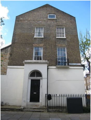
communal entrance door