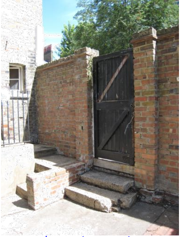
rear garden - entrance gate