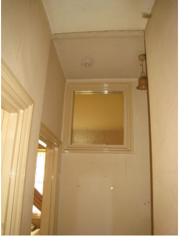
lower maisonette entrance hall