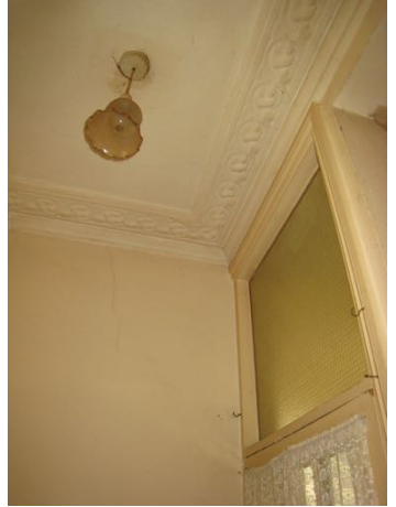
lower maisonette entrance hall