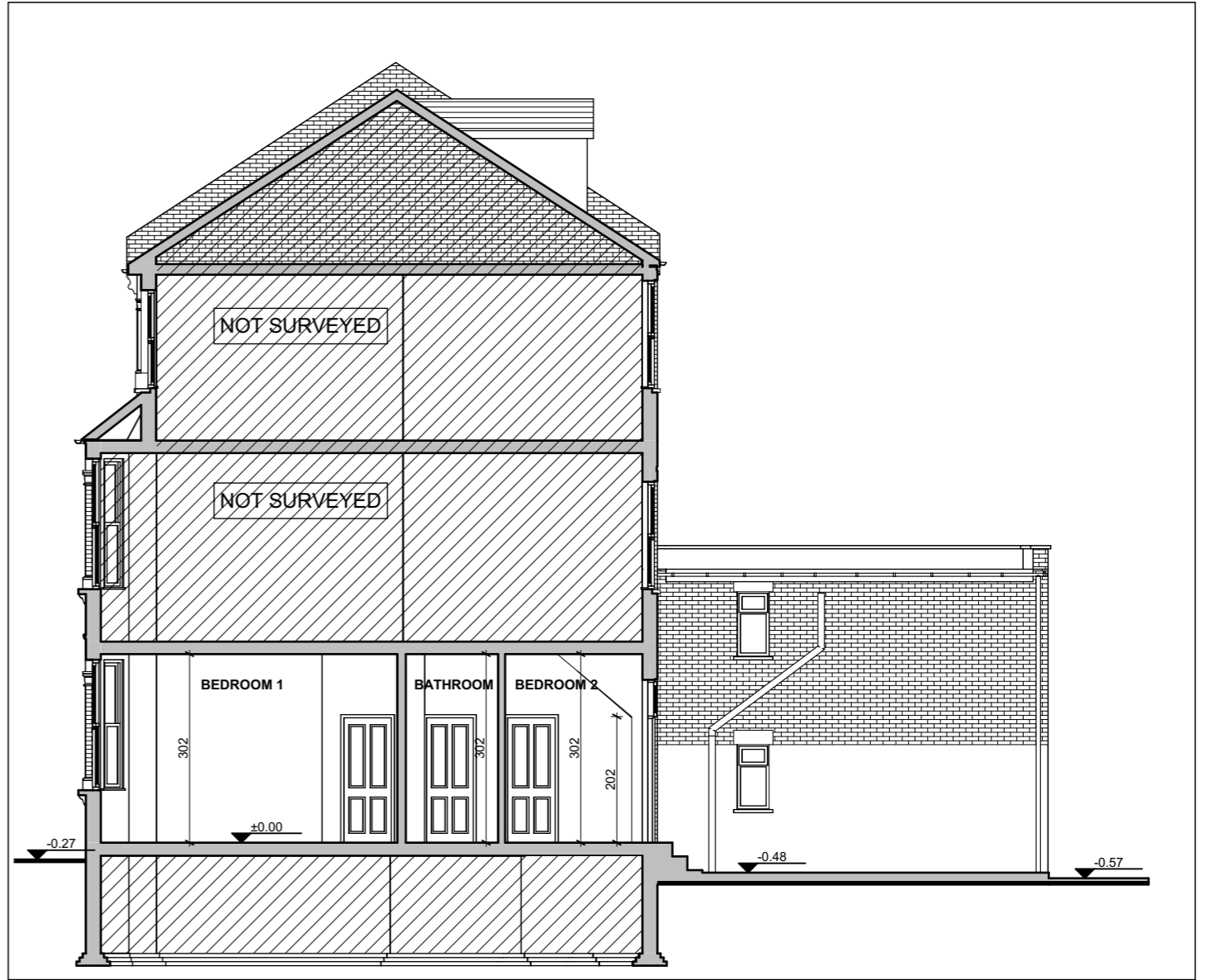
SECTION CC - EXISTING