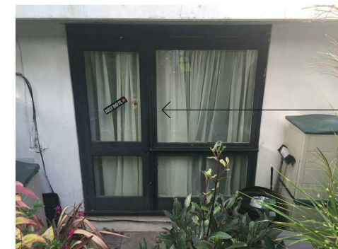
1 Architype C 1 : 50