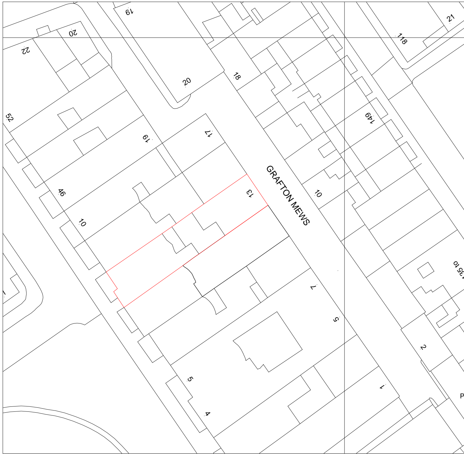
SITE PLAN Scale: 1:500