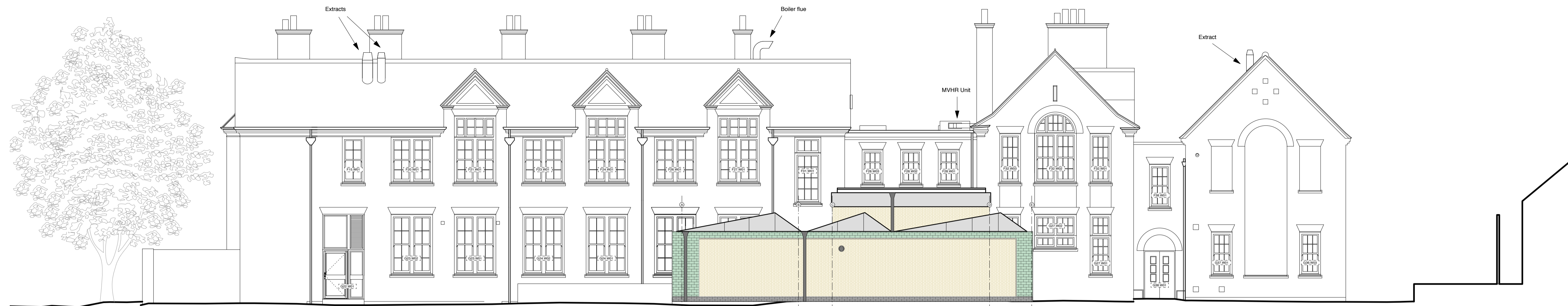
01 South Elevation