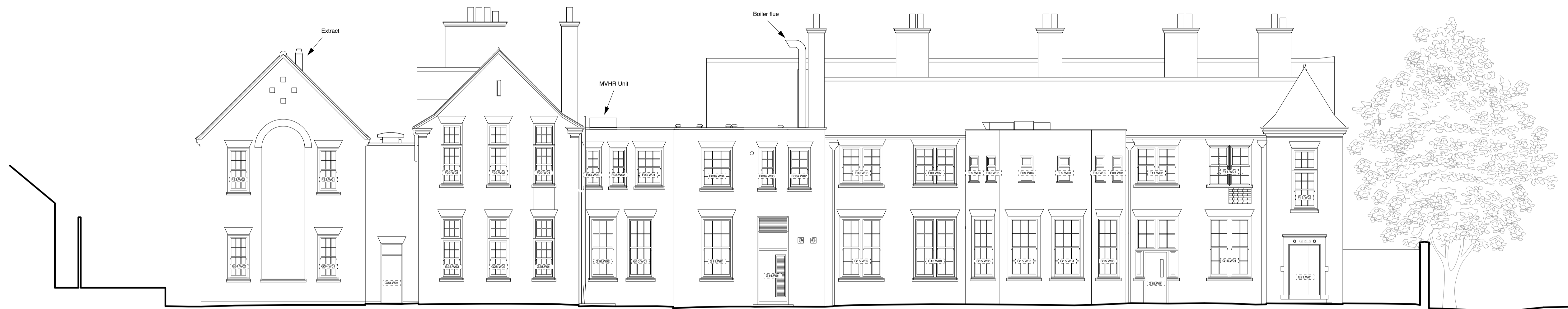
02 North Elevation