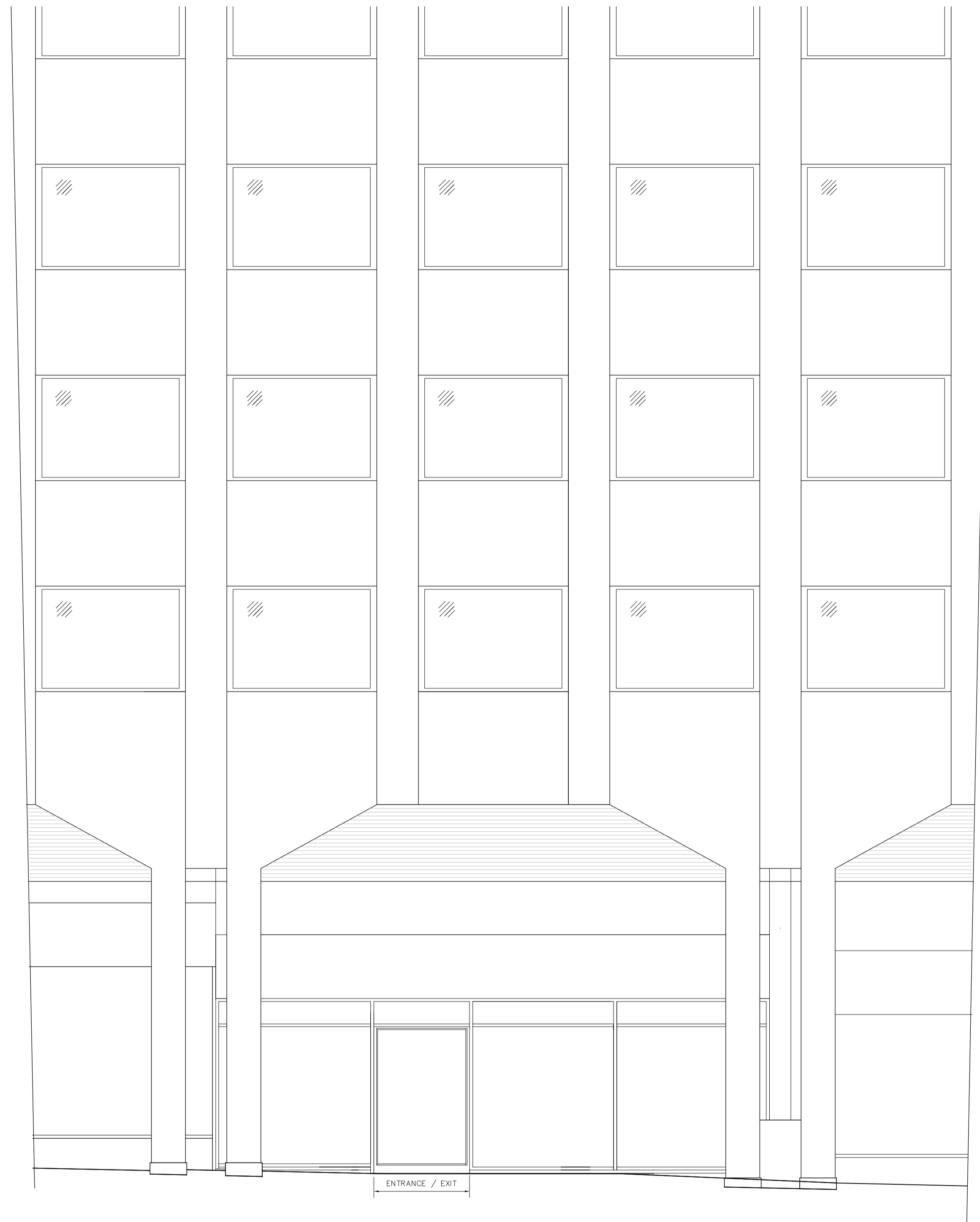
02 APPROVED FRONT ELEVATION P124846290 1:100@A1, 1:200@A3