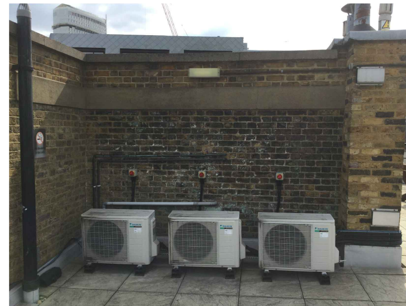
Photograph of existing area