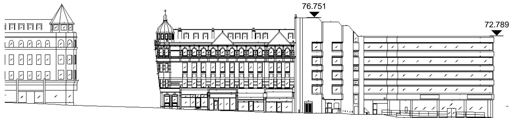
1 West Elevation - Existing 1 : 500