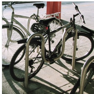
BXMW/MSTAND- Camden Stand CaMden M Stand