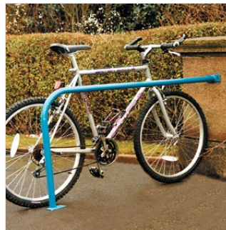
BXMW/OAK Oakdale Cycle Stand