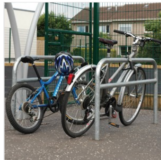
BXMW/S47 Sheffield Extra Cycle Stand