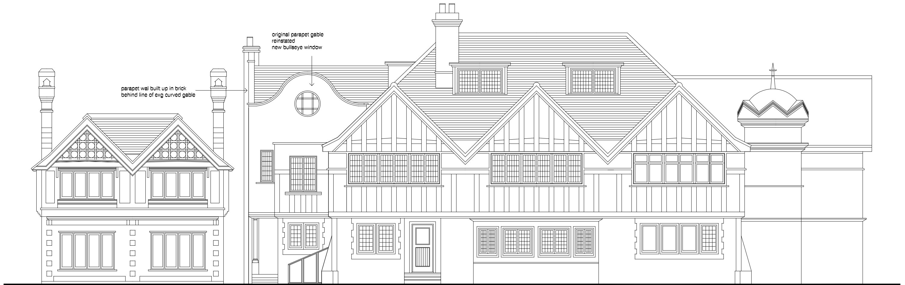
Elevation to Kidderpore Gardens as proposed