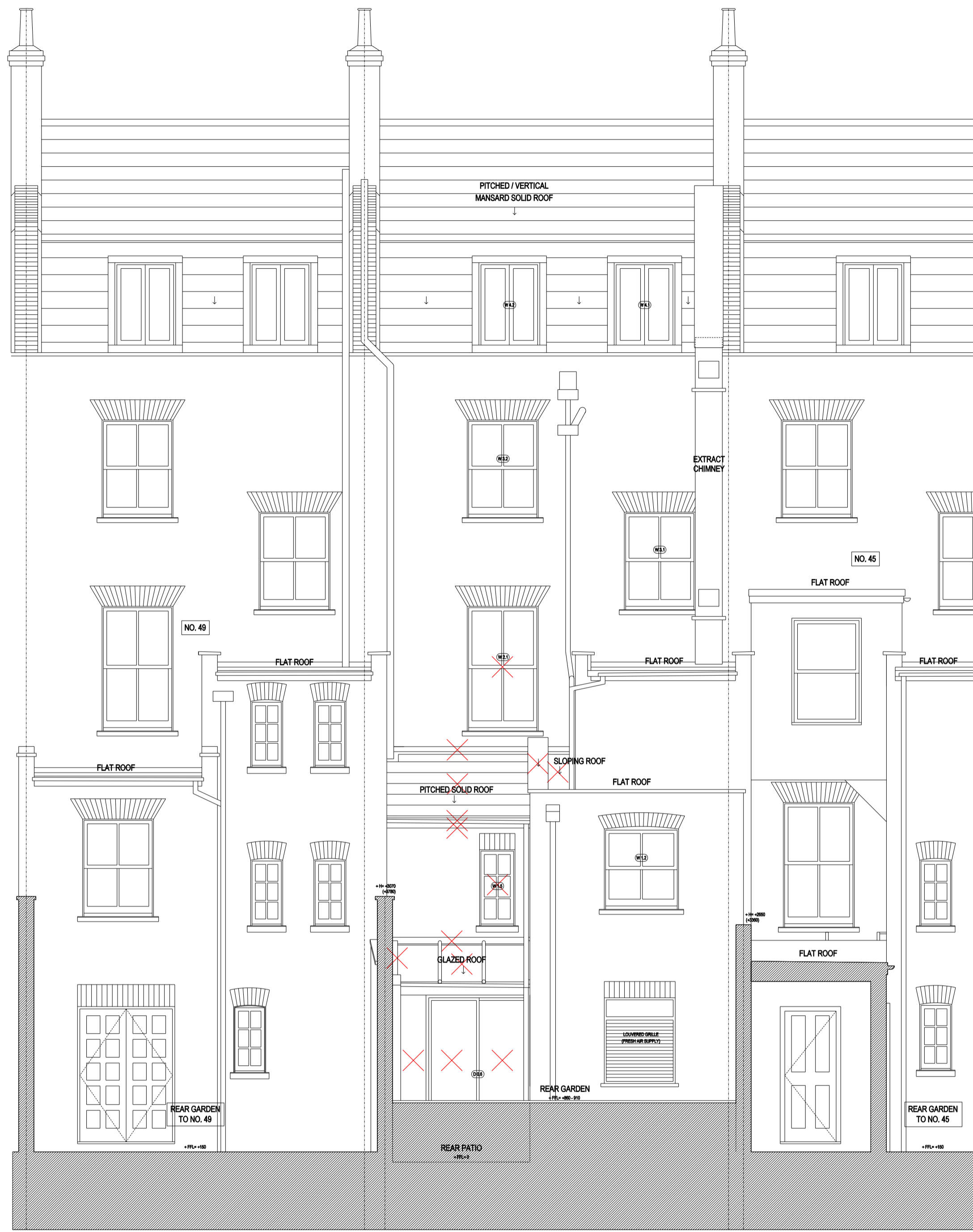
04 EXISTING REAR ELEVATION 04 (15-01-03) Scale 1:50 (@A1 SIZE)