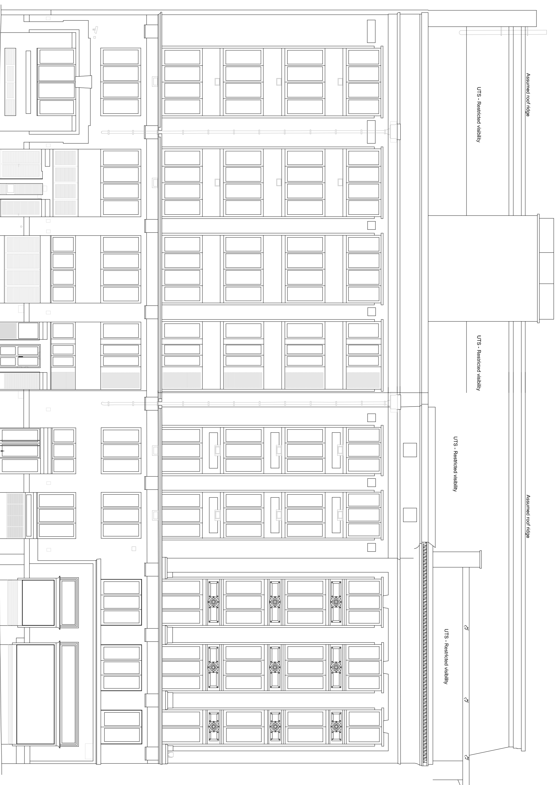
ELEVATION 5 (Remain) (Keeley St.)