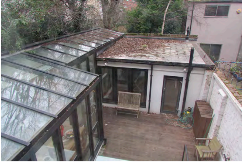
FRONT FACADE OF REAR BUILDING