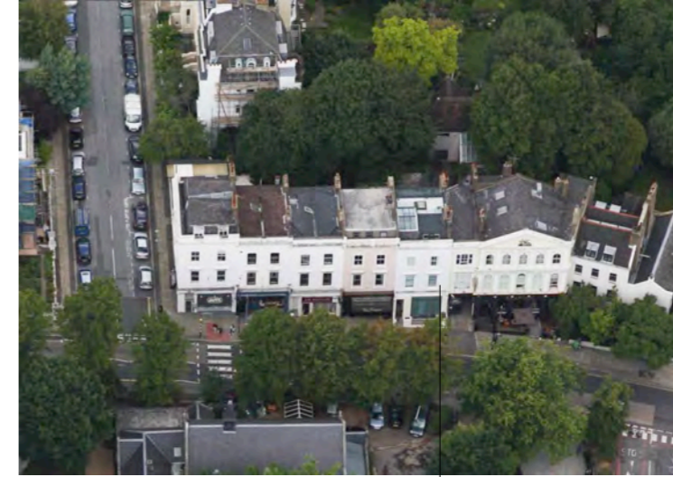
AERIAL SITE VIEW