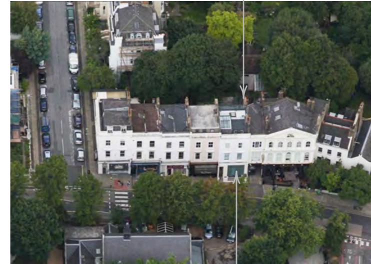
AERIAL SITE VIEW