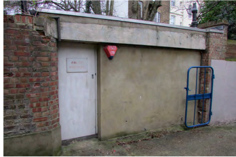
EAST FACADE OF REAR BUILDING