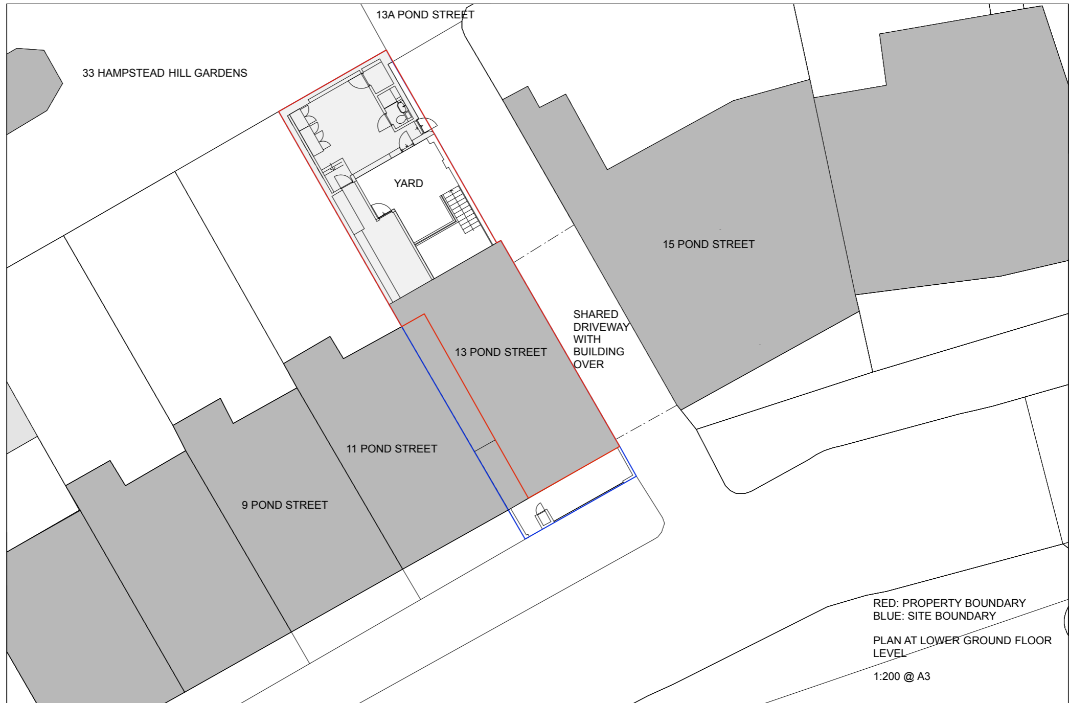
13 POND STREET

RED: PROPERTY BOUNDARY BLUE: SITE BOUNDARY