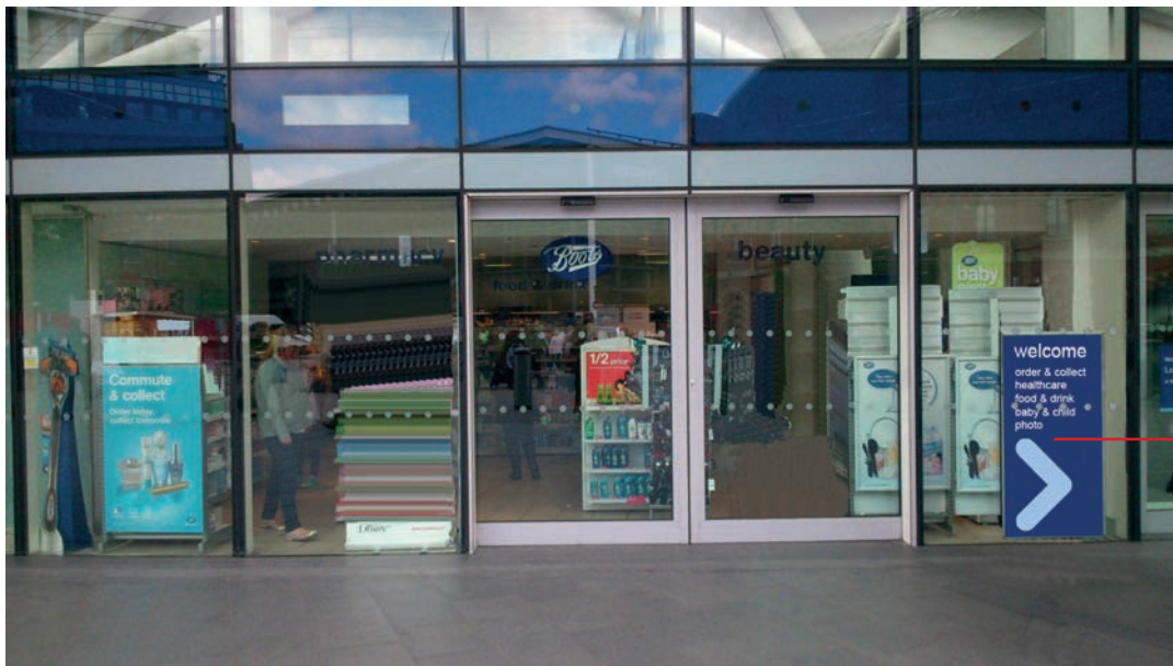
Existing Elevation: streetside.

Existing internal totem to be over clad with dark blue vinyl welcome panel.