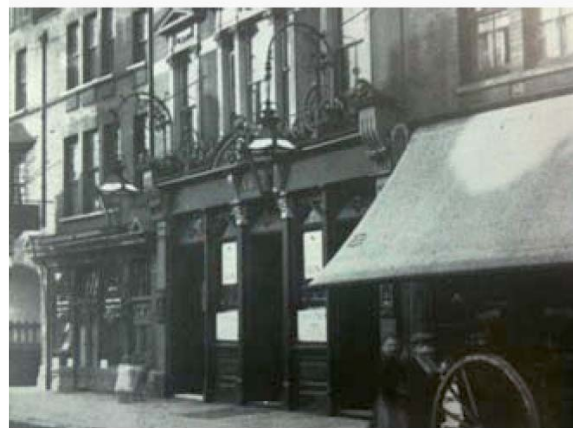
A Victorian pub with oversized lanterns and brackets.