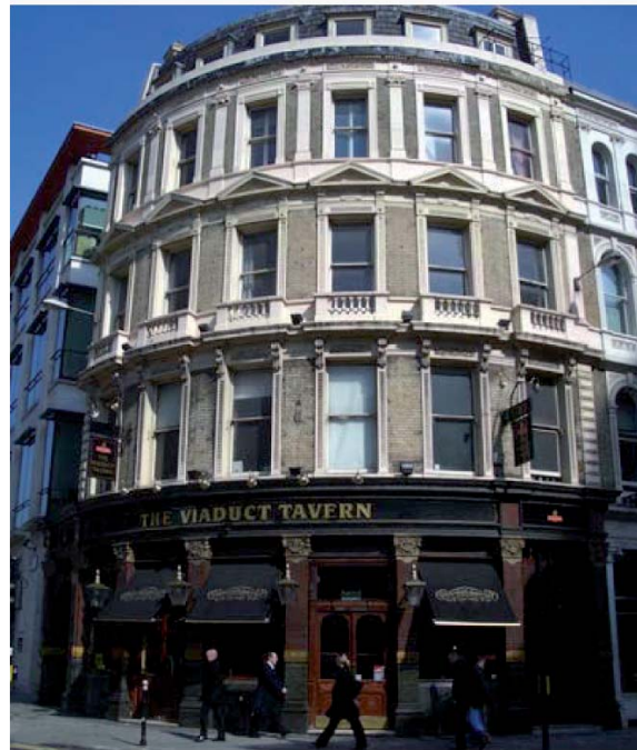
126 Newgate St. EC1A 7AA Built within 10 years of the Big Chill House (formerly The Bell) the Viaduct Tavern also has granite stall riser and pilasters with similar detailing. The image shows awnings, plus large sections of fixed glazing with fan lights above.