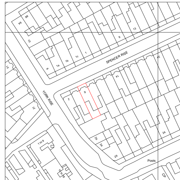
LOCATION PLAN Scale: 1:1250