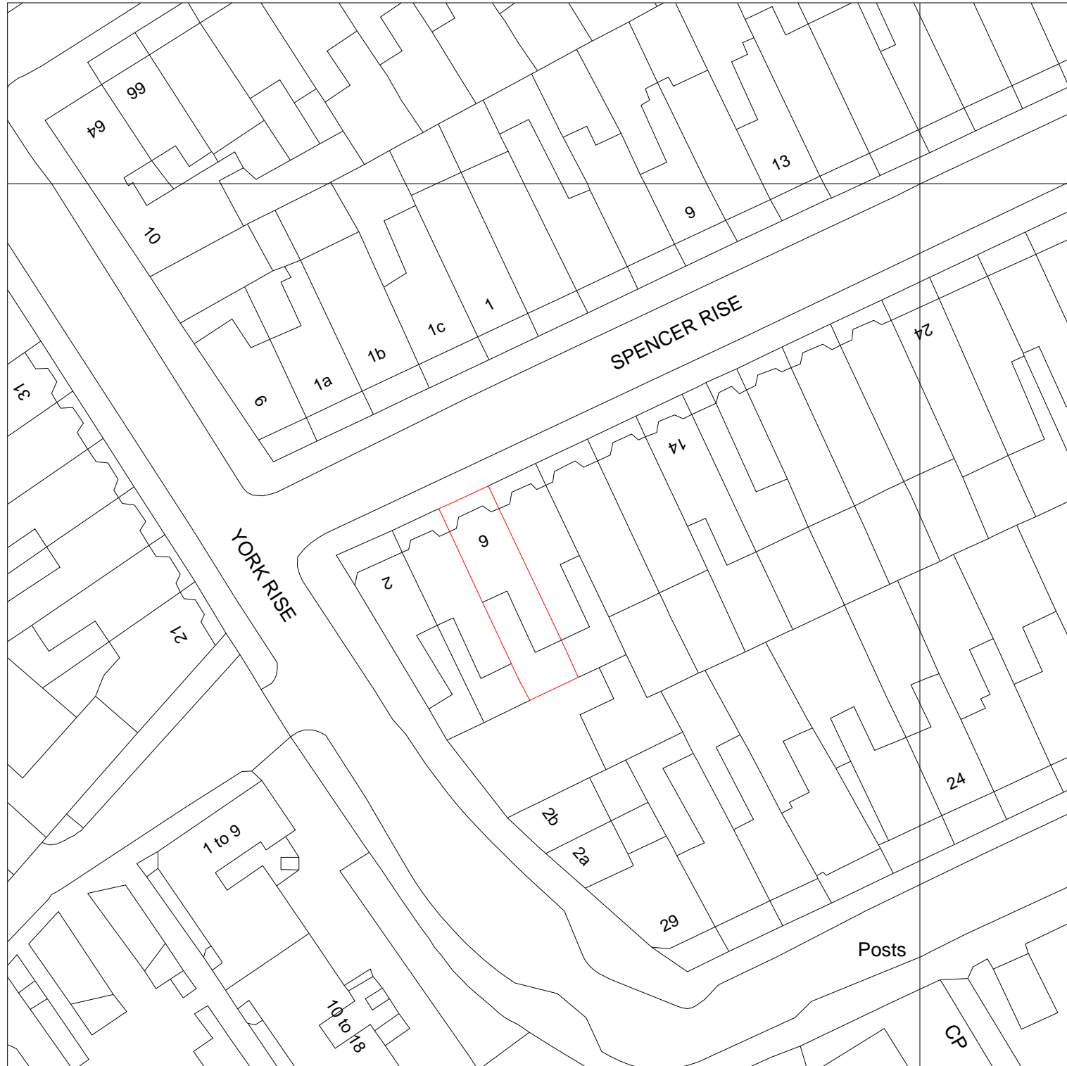
SITE PLAN Scale: 1:500