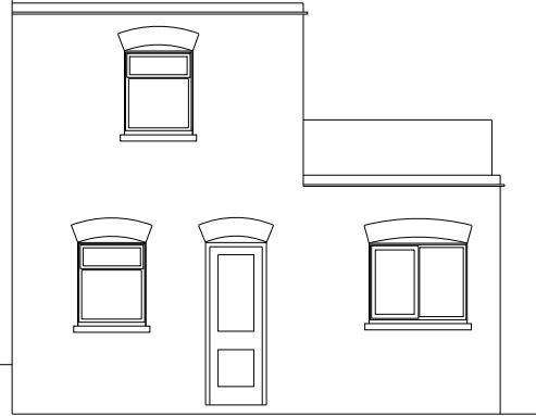
REAR ELEVATION (EXISTING)

EXISTING TIMBER SASH WINDOWS TO BE RENEWED