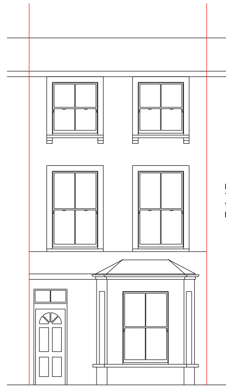
FRONT ELEVATION (EXISTING)

EXISTING TIMBER SASH WINDOWS TO BE RENEWED