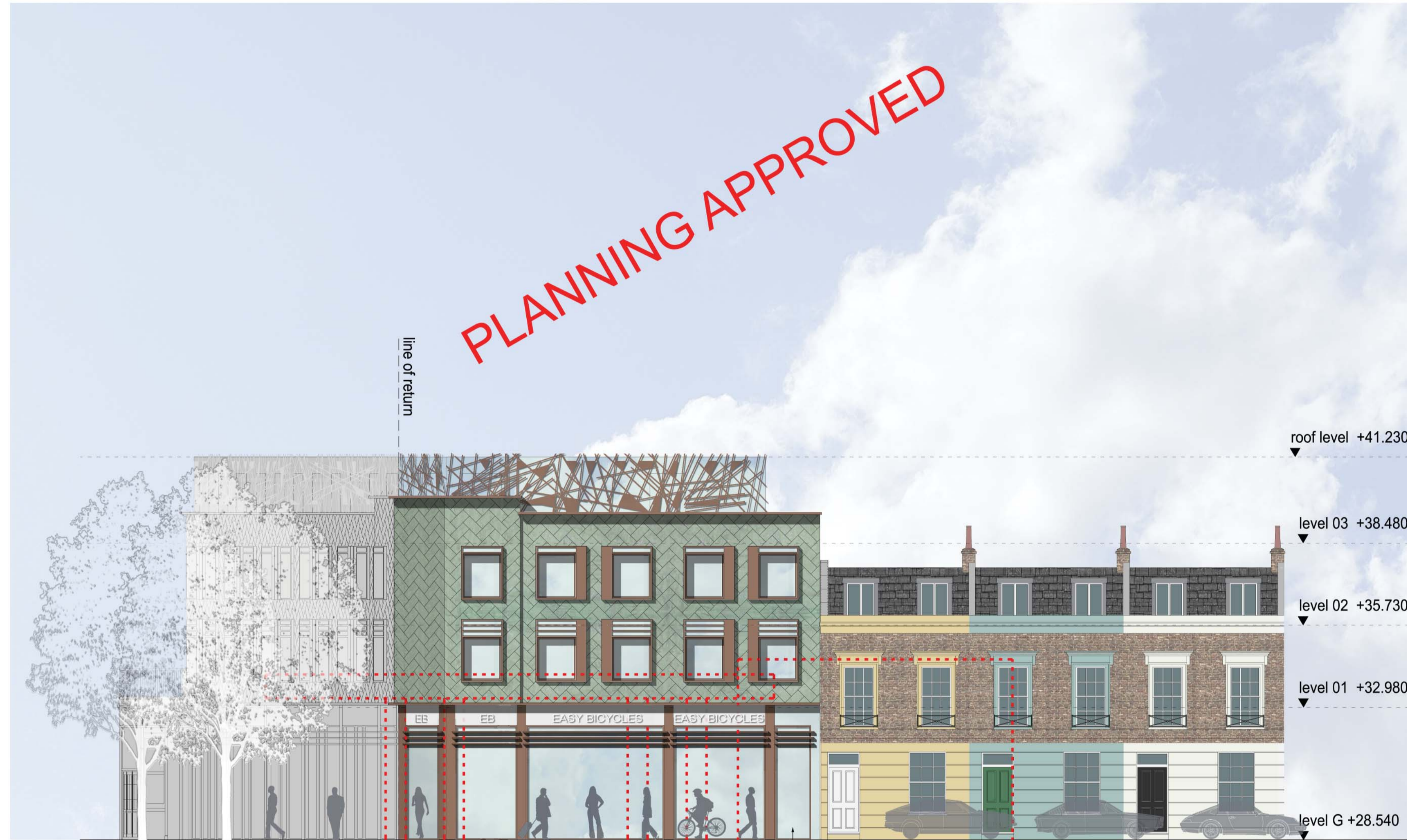
HARTLAND ROAD ELEVATION