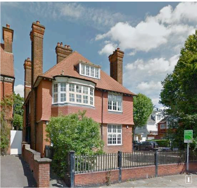
SOUTH-EAST SIDE FACADE - ELSWORTHY ROAD