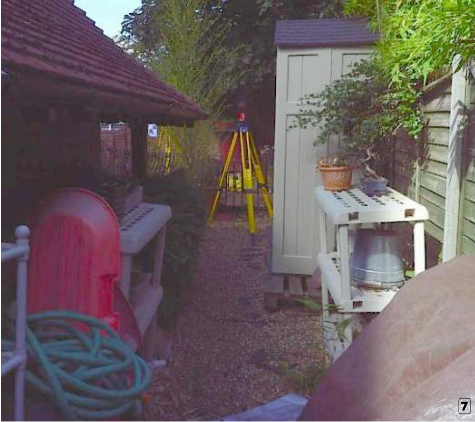
NORTH-WEST SIDE PASSAGE

All dimensions are to be checked on site before commencement of works.