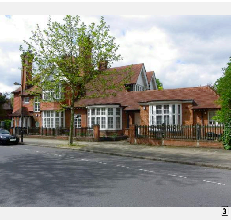
EAST-MAIN FACADE - WADHAM GARDENS