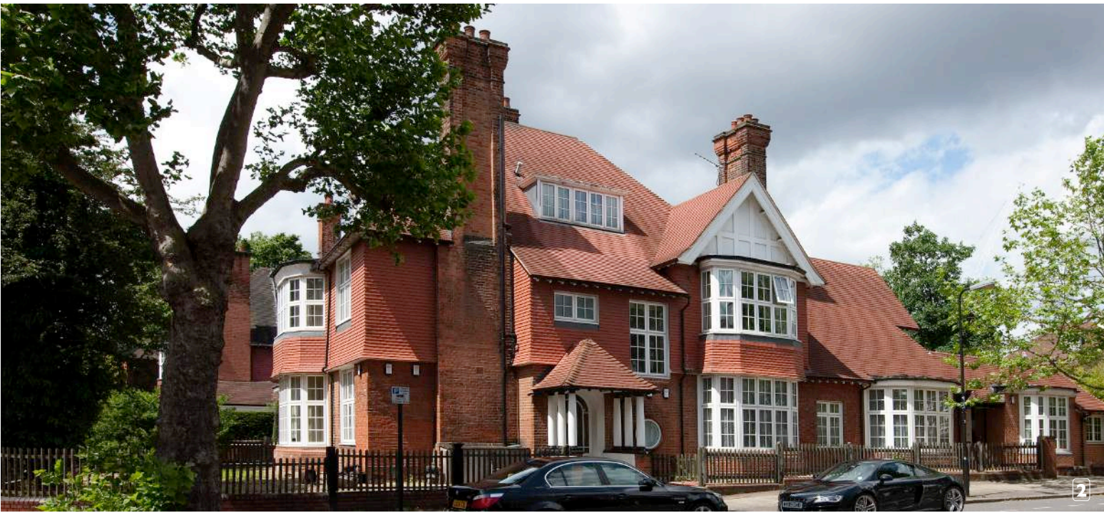
EAST-MAIN FACADE - WADHAM GARDENS