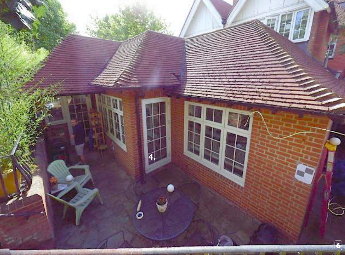
NORTH-WEST BACK TERRACE