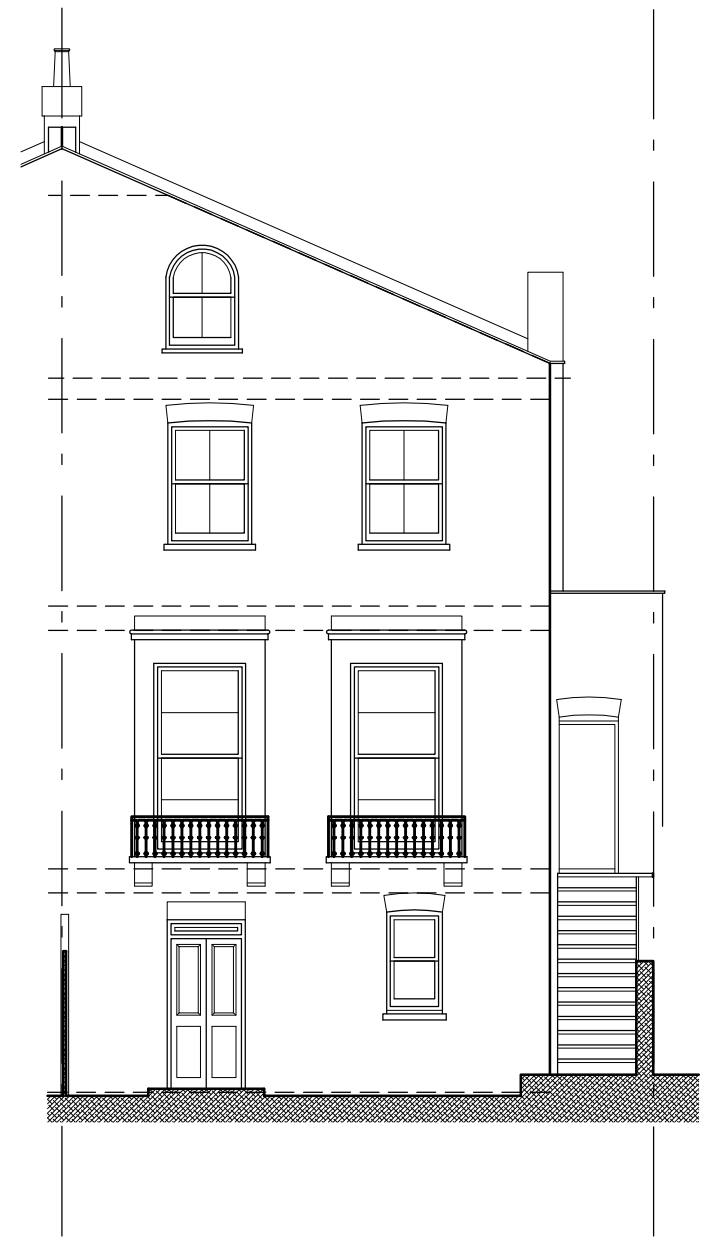
REAR ELEVATION D-D - (AS EXISTING)