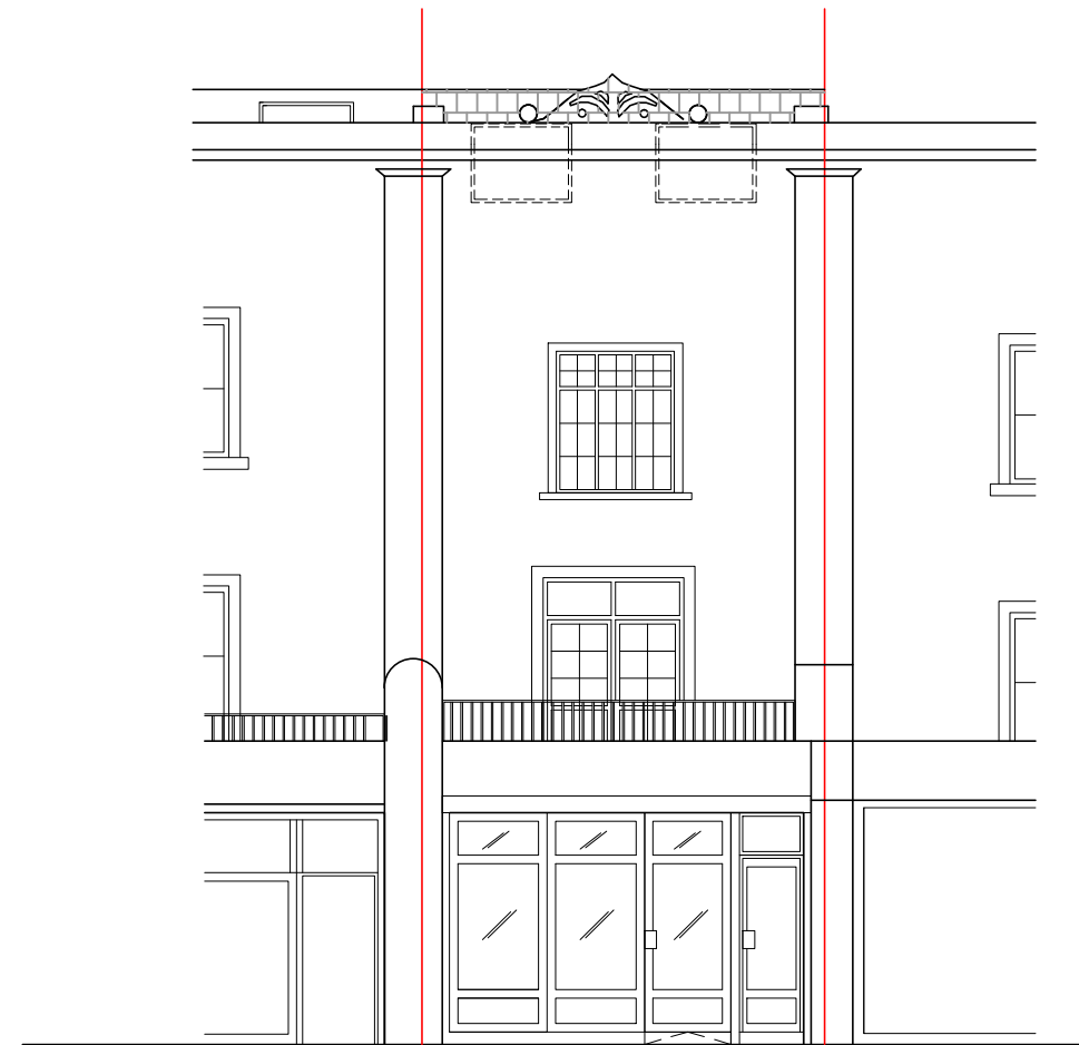
EXISTING FRONT ELEVATION SCALE: 1/100