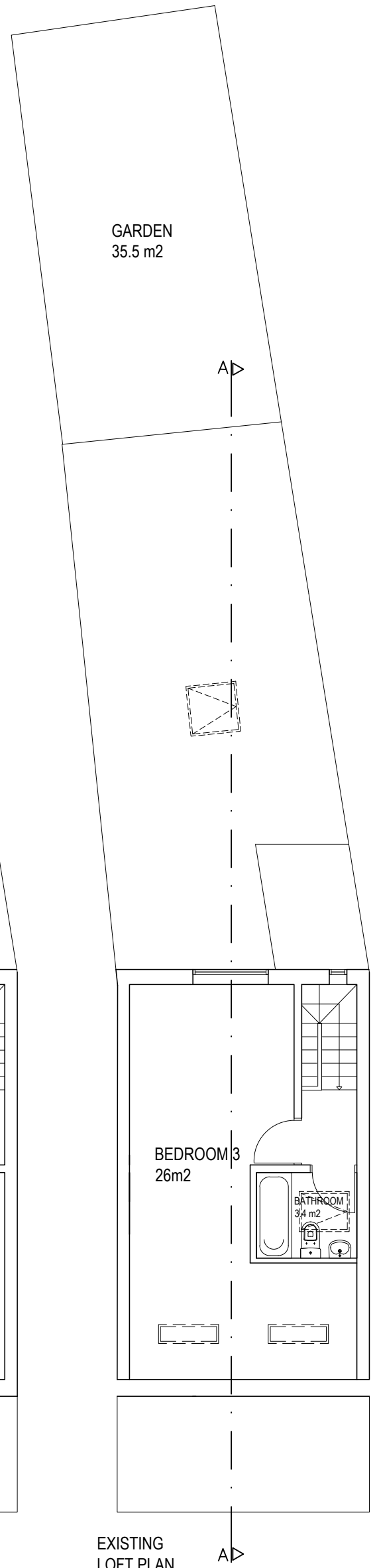
EXISTING LOFT PLAN