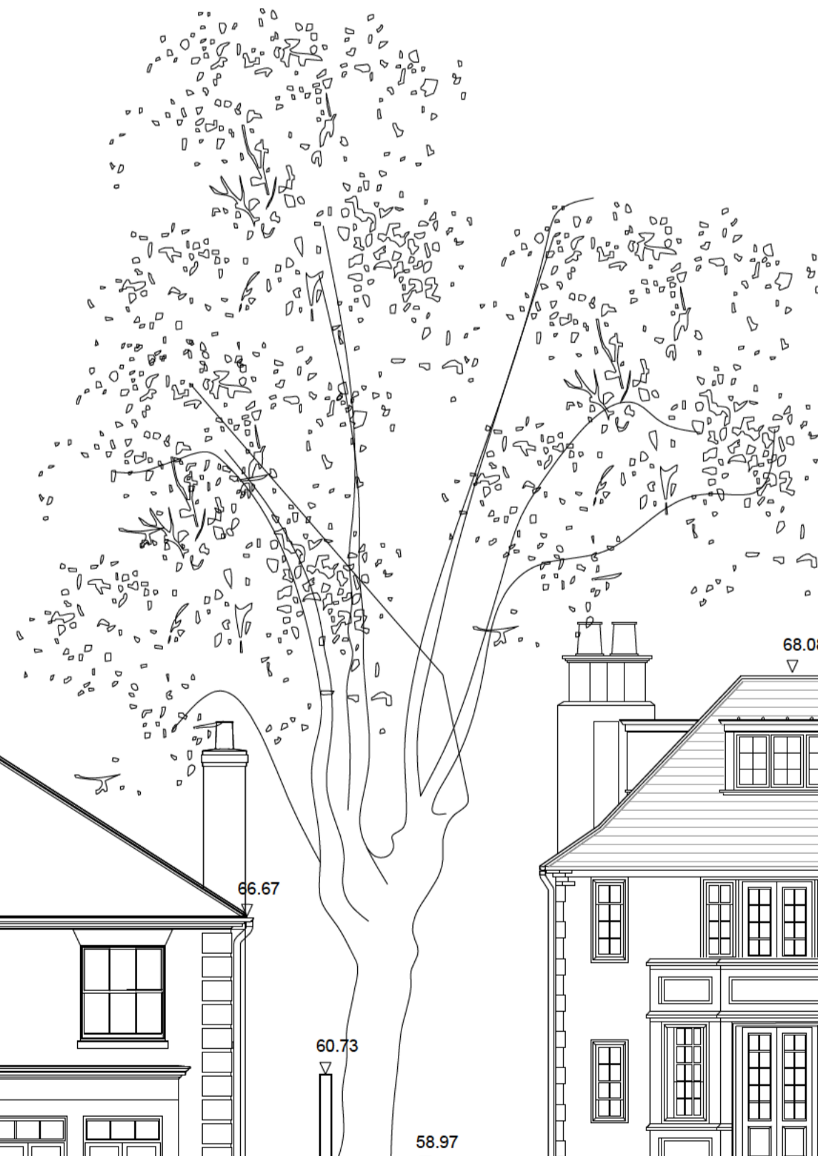
PROPOSED FRONT (NORTH FACING) ELEVATION 1:100@A1 1:200@A3

PORTLAND STONE BAY TO REAR ELEVATION PORTLAND STONE LINTEL AND SURROUNDS TO TIMBER DOUBLE GLAZED CASEMENT WINDOWS CODE 4 LEAD FLAT ROOF WITH TRADITIONAL ROLLS DOUBLE GLAZED AND LEAD TO DETAIL TRADITIONAL GLASS SUN ROOM