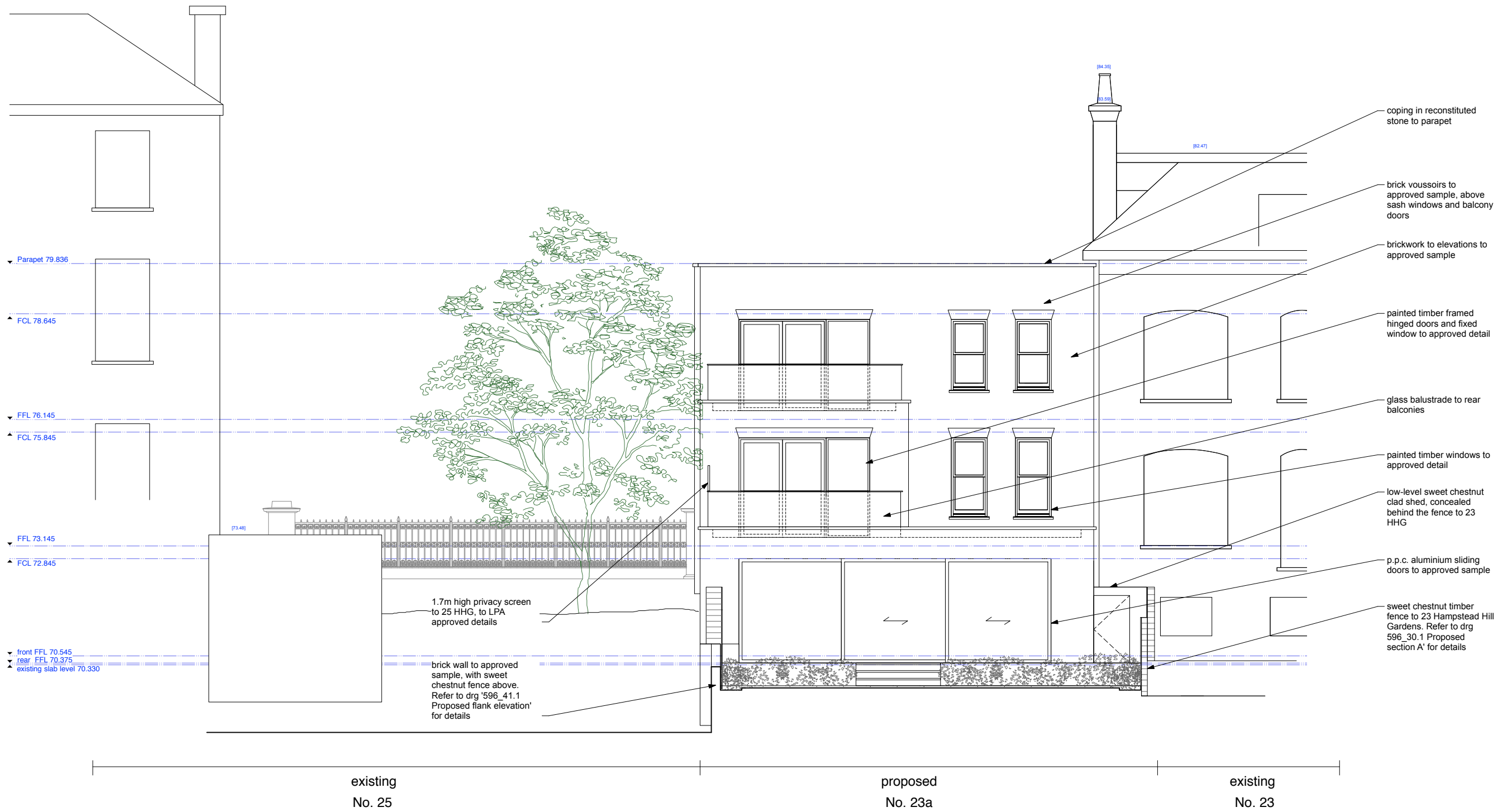
1 Rear elevation Scale: 1:50