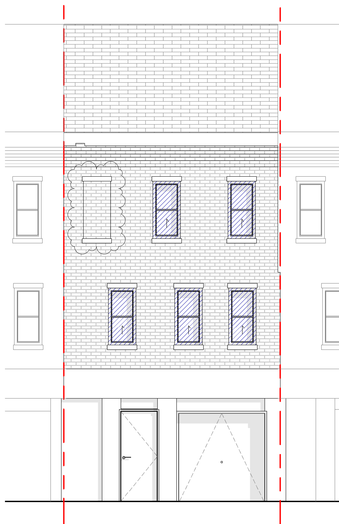
2 Front Elevation - Proposed 1 : 50