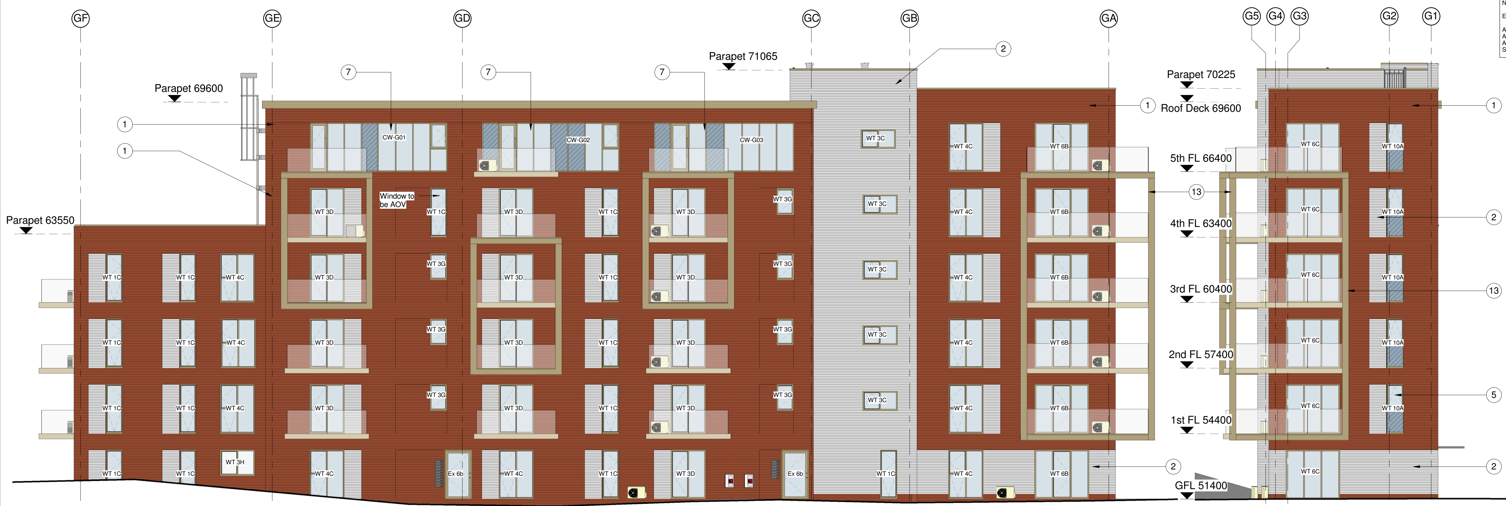
Block G South 1 : 100

NOTE: Elevations to be read in line with: A31-G01 - Curtain Wall Details Block G A32-G01 - External Door Schedule Block G A31.4-01 to 03 - Window Types Schedule Sheet 1 to Sheet 3 This drawing is copyright and shall not be reproduced or used for any other purpose without the written permission of the Architects. This drawing must be read in conjunction with all other related drawings and documentation. It is the contractor's responsibility to ensure full compliance with the Building Regulations. Do not scale from this drawing, use figured dimensions only. It is the contractor's responsibility to check and verify all dimensions on site. Any discrepancies to be reported immediately. IF IN DOUBT ASK Materials not in conformity with relevant British or European Standards/Codes of practice or materials known to be deleterious to health & safety must not be used or specified on this project. Materials known to contain asbestos contaminated materials (ACM's) in the manufacture or installation process have not been specified and must not be used on this project.