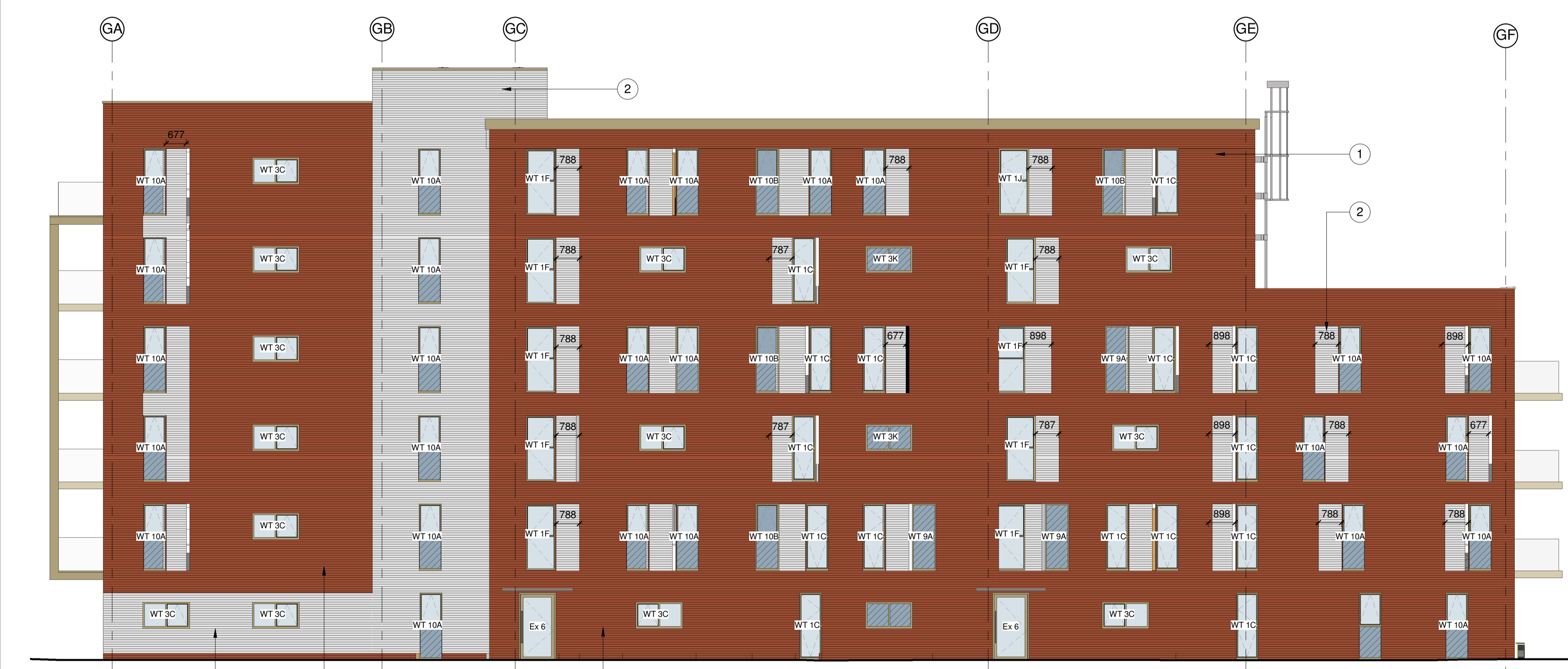
Block G North 1 : 100

JOB NO. 12-316 DRAWING NO. A00-G21 REV Z