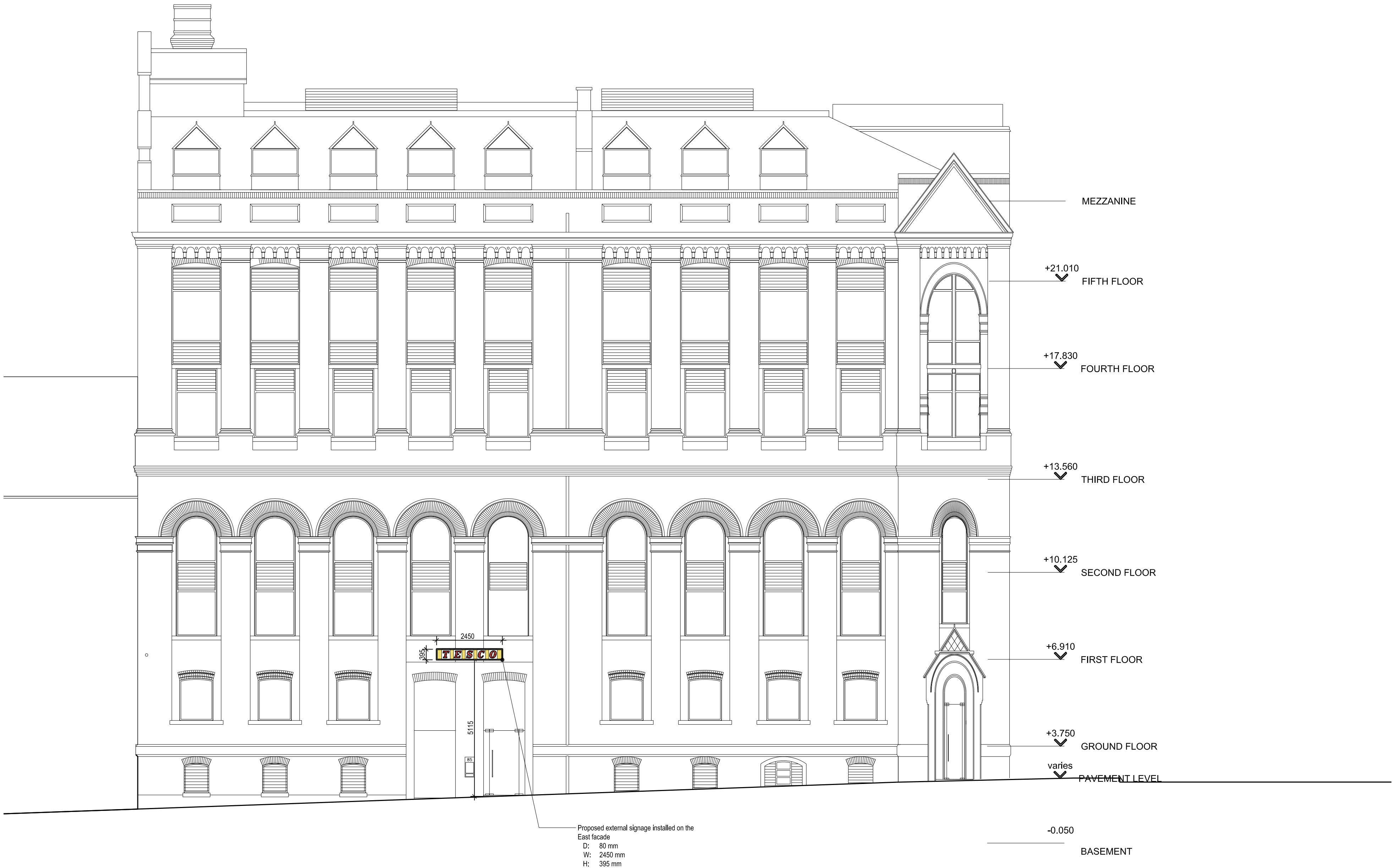
SCALE 1:100 @ A1 PROPOSED NORTH ELEVATION