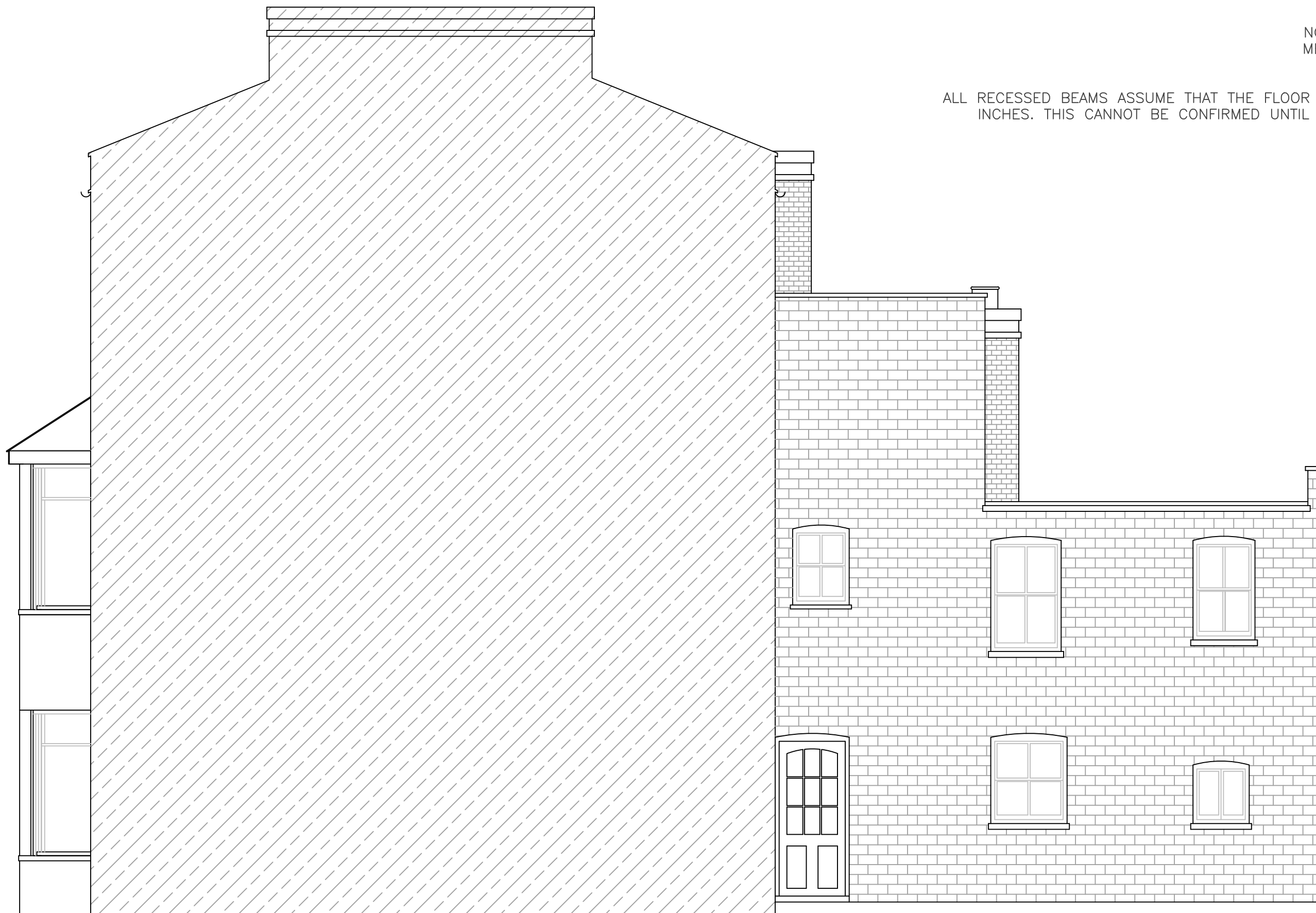
EXISTING SIDE ELEVATION 1:50

ALL RECESSED BEAMS ASSUME THAT THE FLOOR THICKNESS IS SIX INCHES. THIS CANNOT BE CONFIRMED UNTIL THE BUILD PHASE