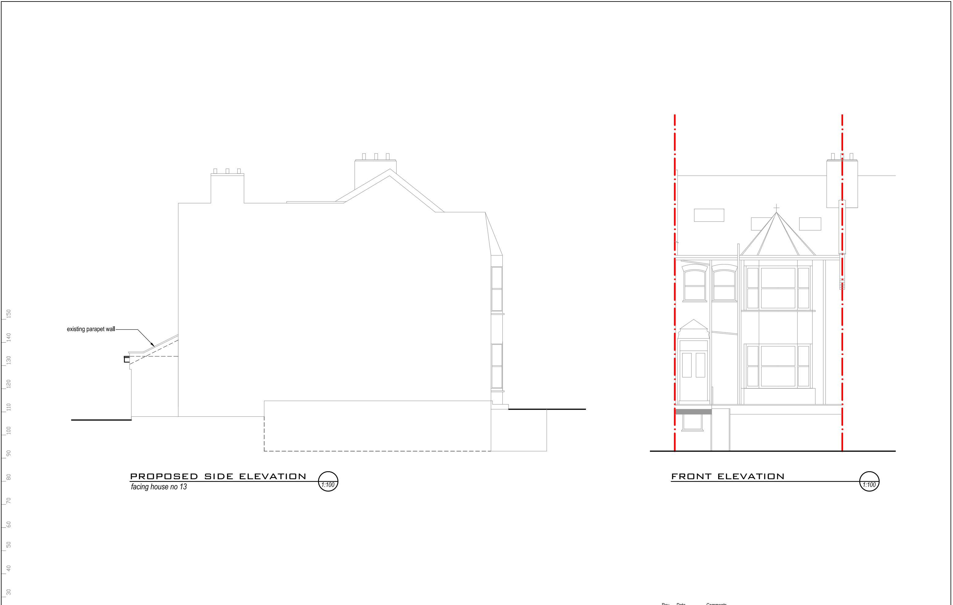
PROPOSED SIDE ELEVATION facing house no 13