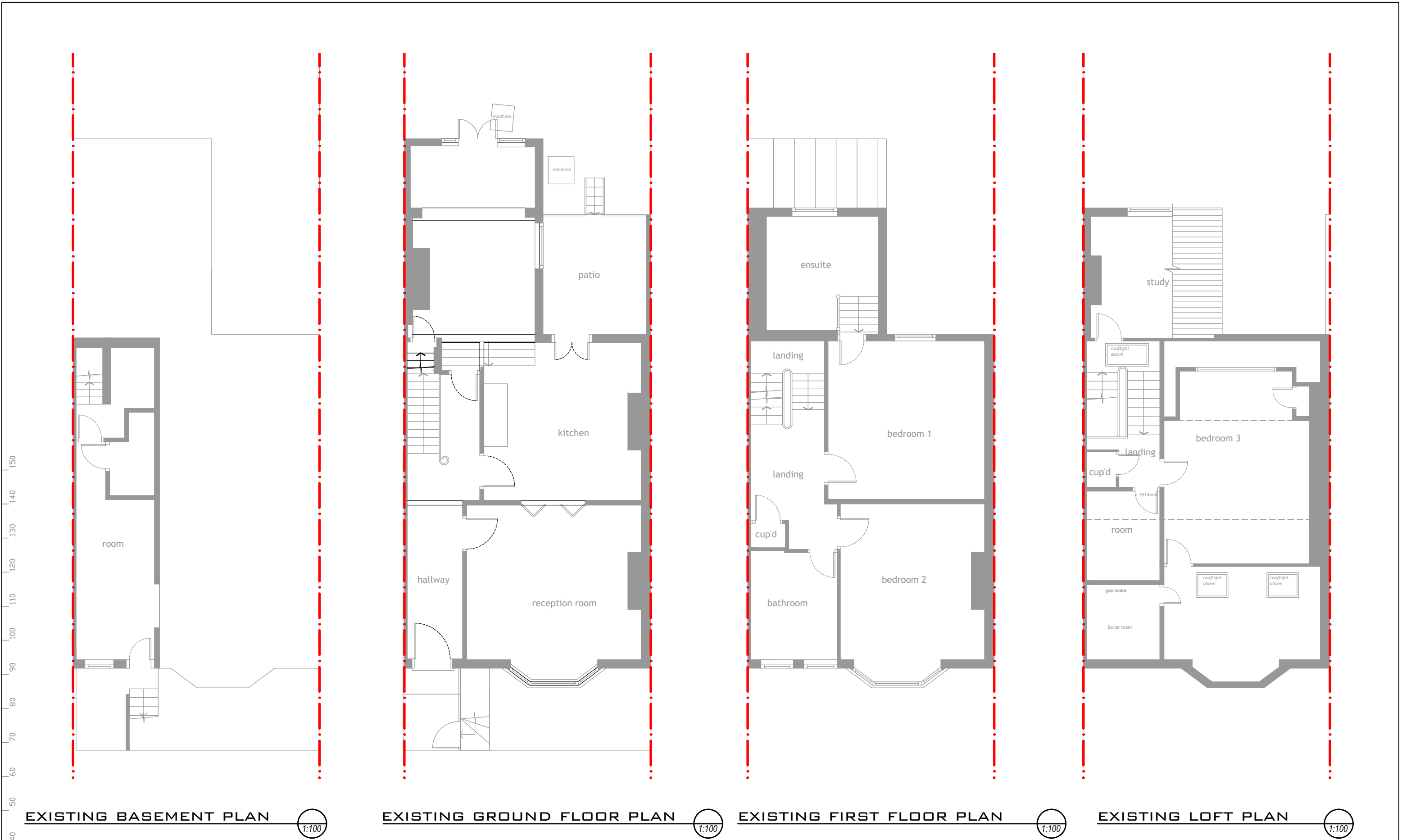
EXISTING BASEMENT PLAN