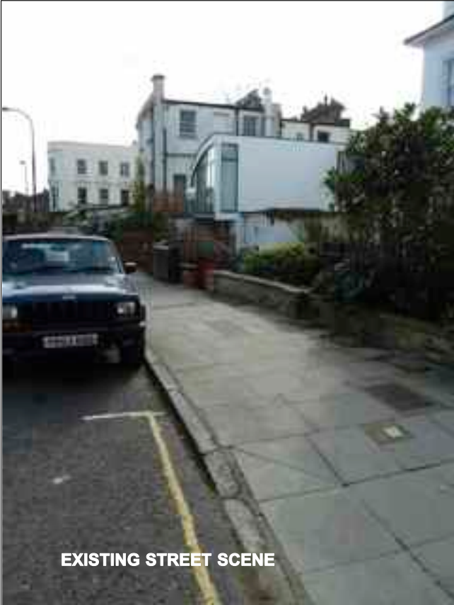
EXISTING STREET SCENE