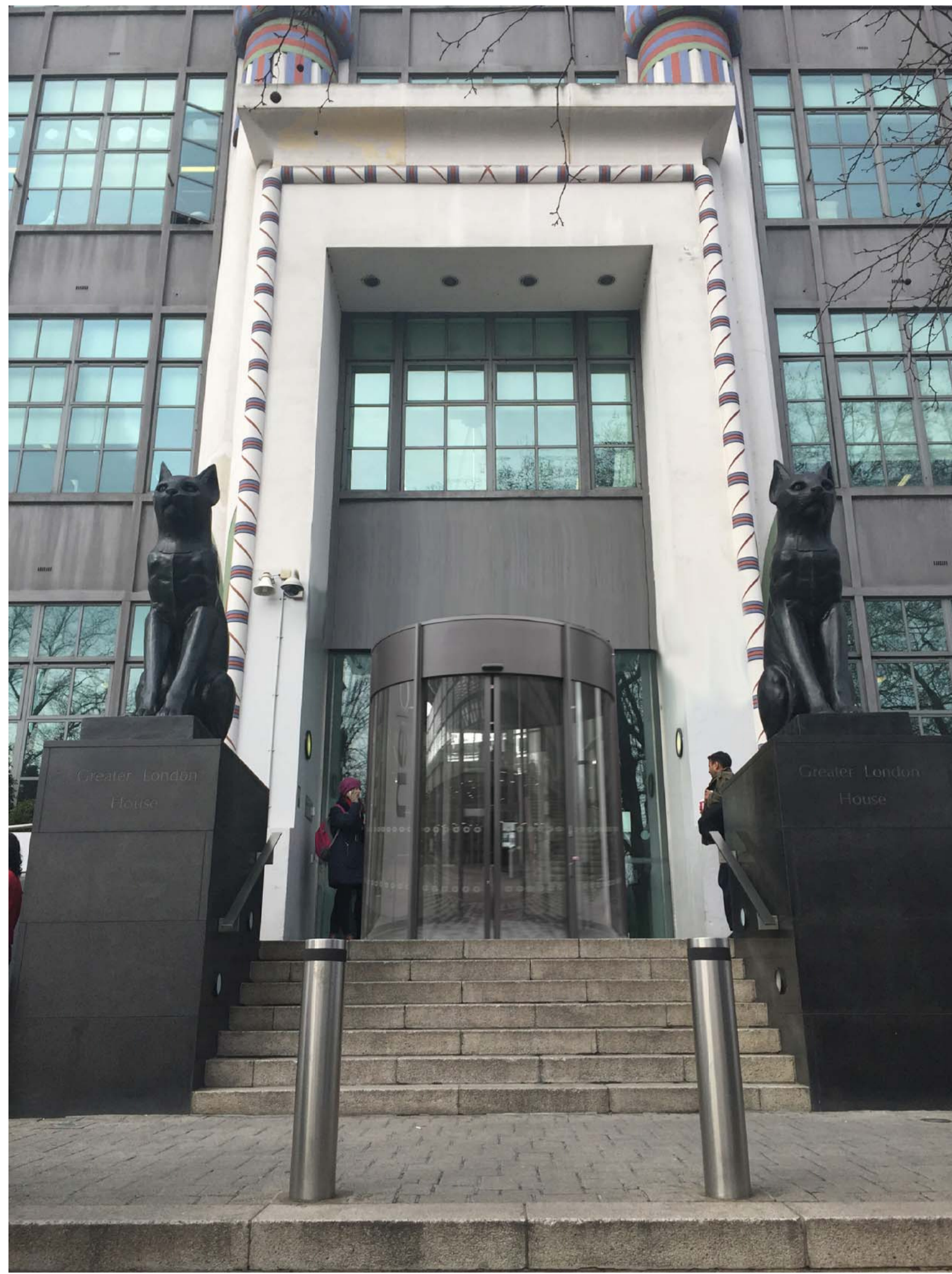
IMAGE OF PROPOSED NEW ENTRY DOORS