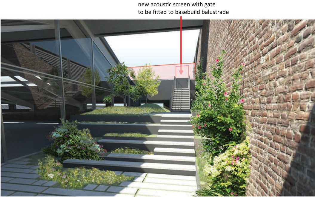
View from Roof Garden towards Roof Terrace with acoustic screen and gate