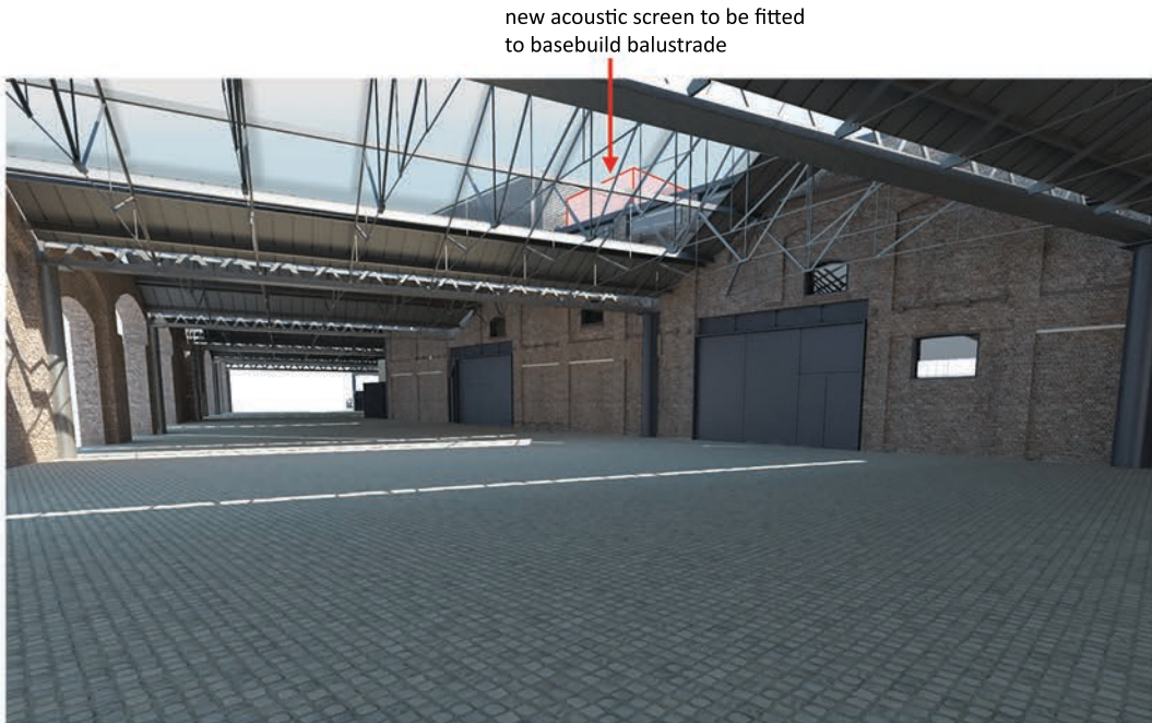
View from the West Handyside Canopy towards Roof Terrace with acoustic screen