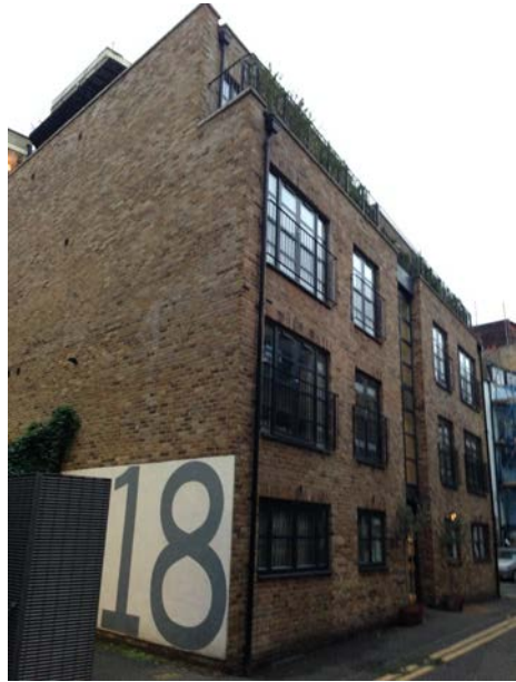
Photo 2 Hatton PI Street view