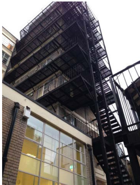
Photo 1 neighbouring property west of the light well/alleyway