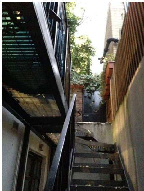
Photo 3 Flat 2 no. 17 Existing terrace and stair