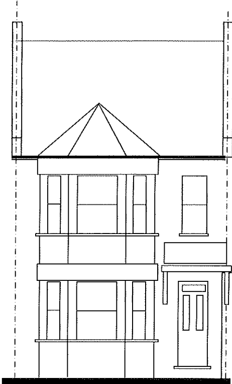
Existing - Front Elevation