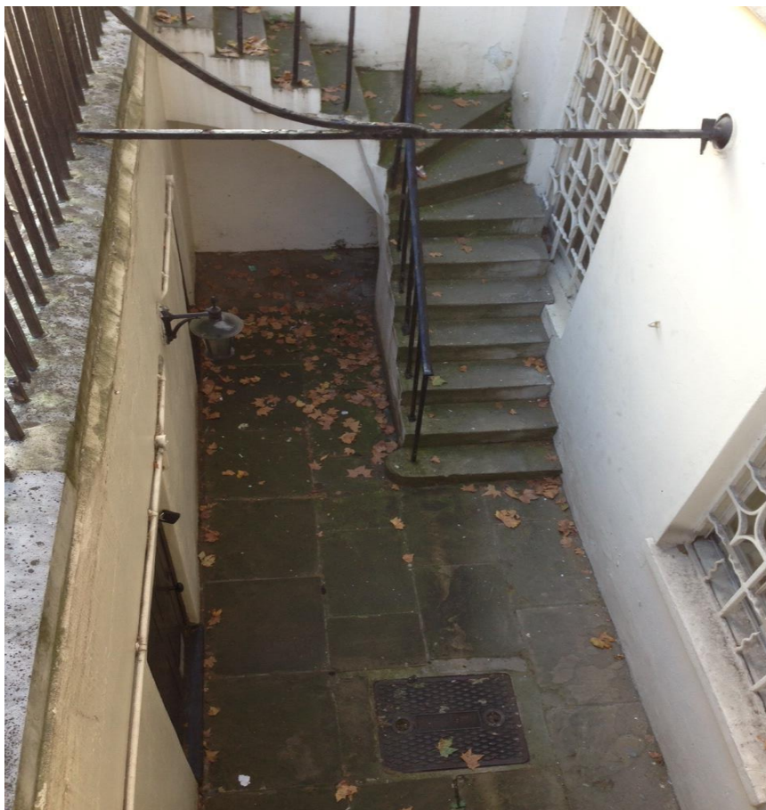
Photograph Two: Front lightwell and pavement vaults