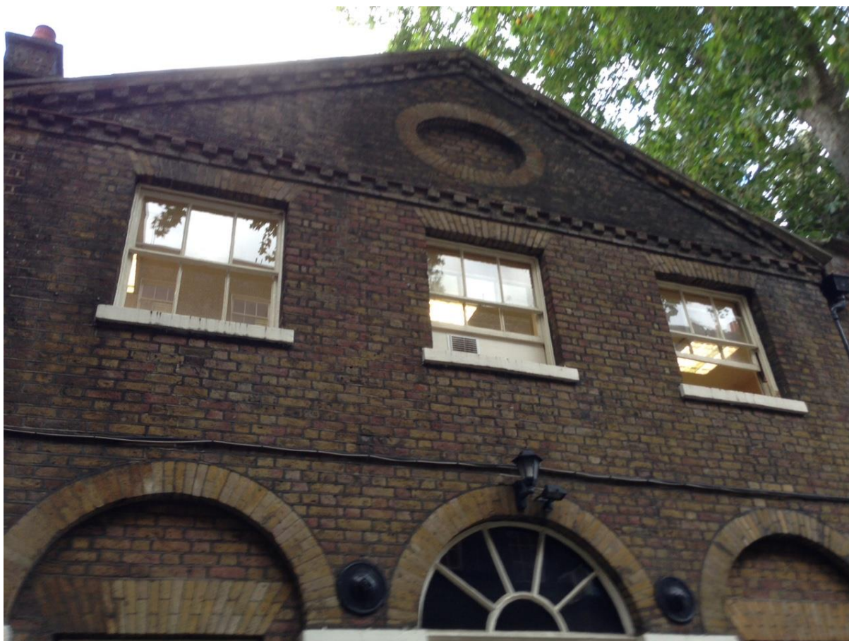
Photograph Three: Coach house building in rear