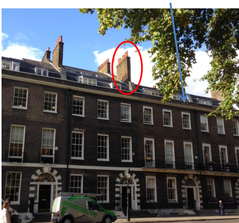
Photograph One: Front Façade of Bedford Square