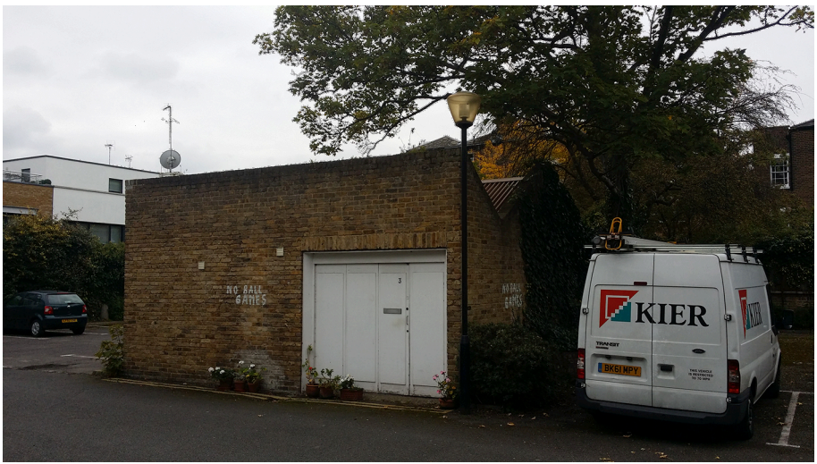
View From Whitcher Place