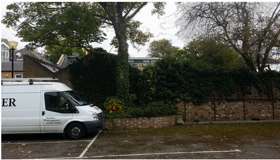
View From Parking Off Whitcher Place