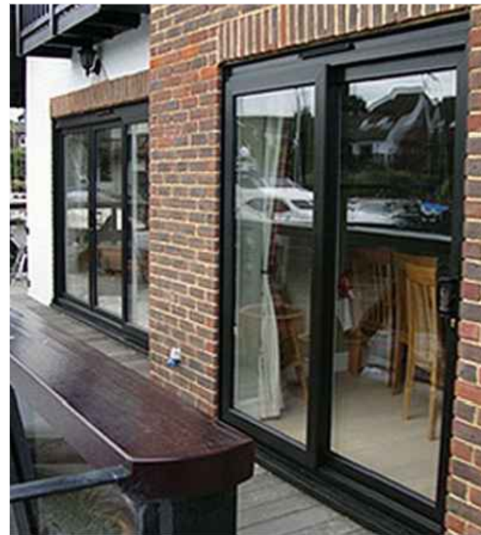
NEW FRAMED GLASS ENTRANCE DOOR