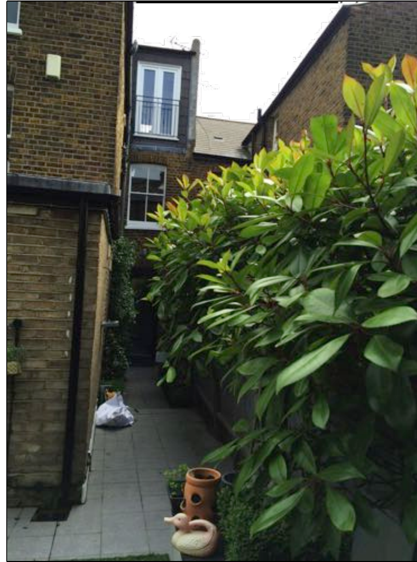
REAR ELEVATION 44 AGAMEMNON ROAD