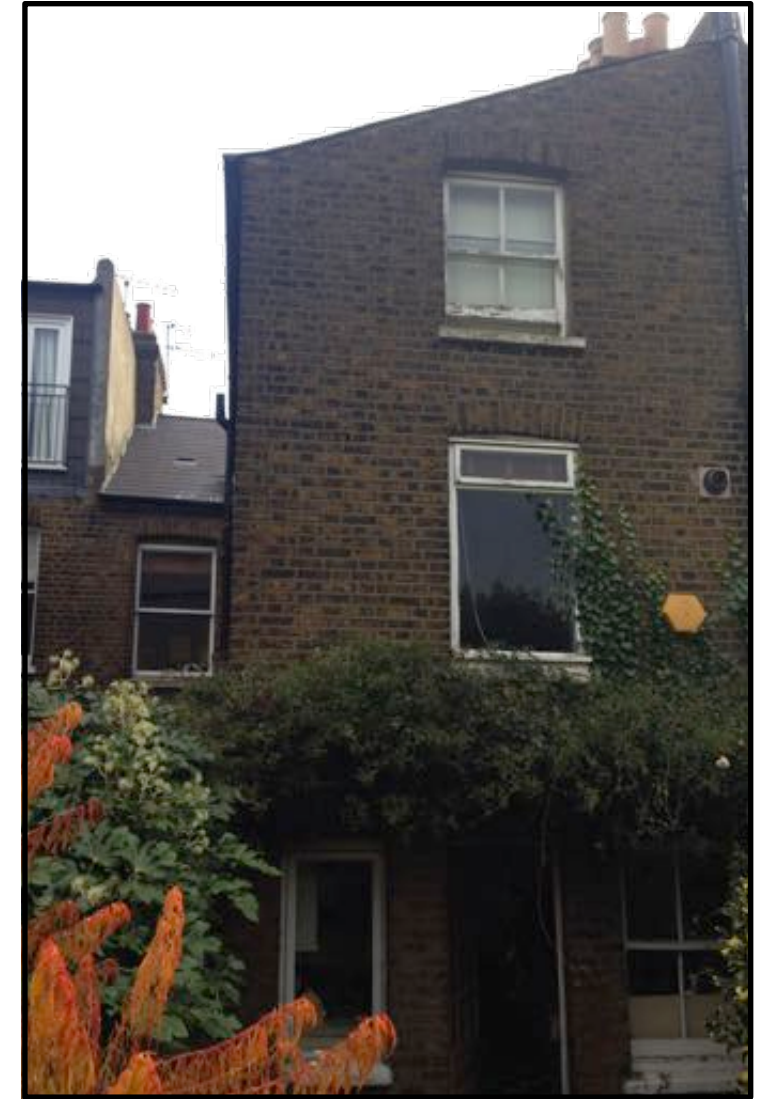
REAR ELEVATION 42 AGAMEMNON ROAD