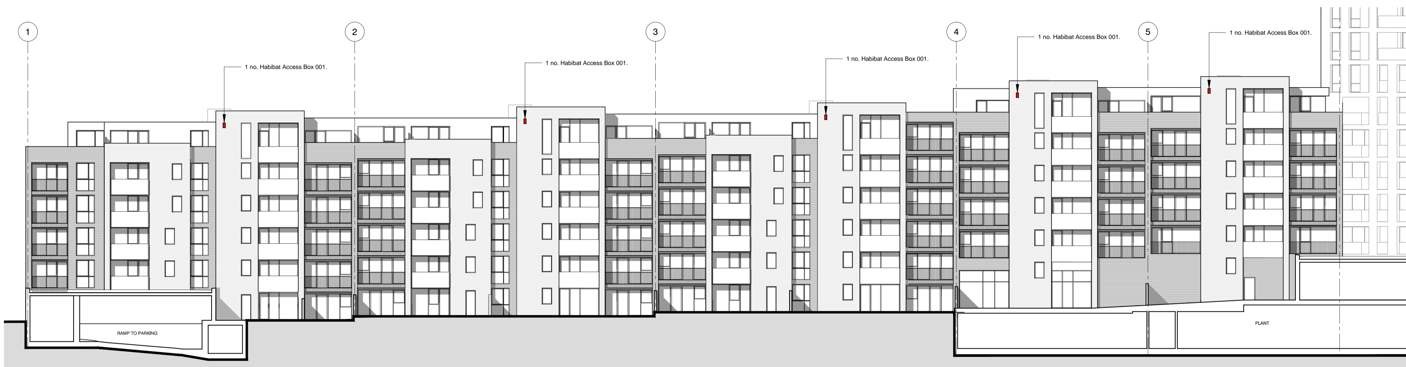
2 Bat box locations South East Elevation