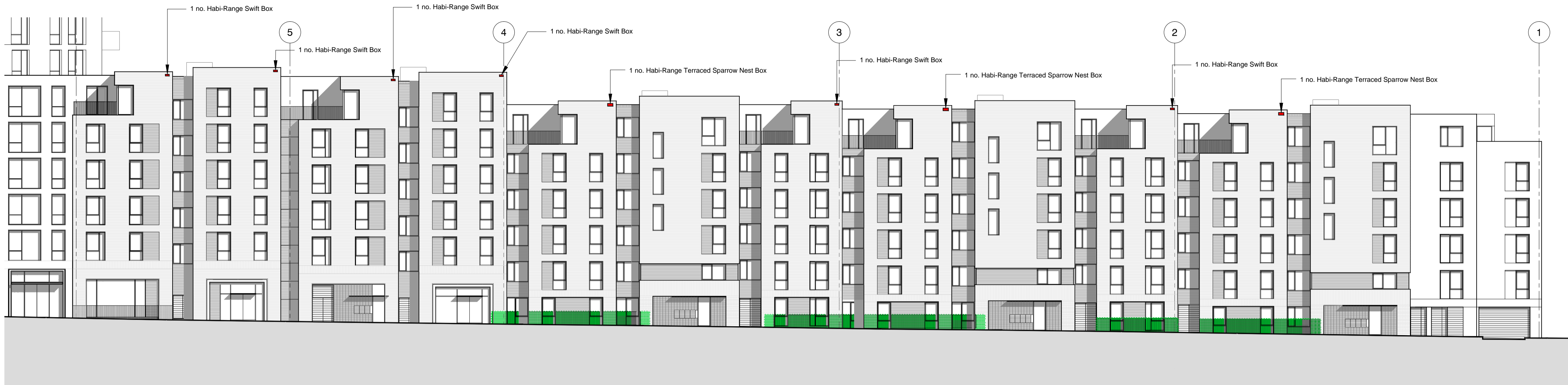
1 Bird box locations North West Elevation