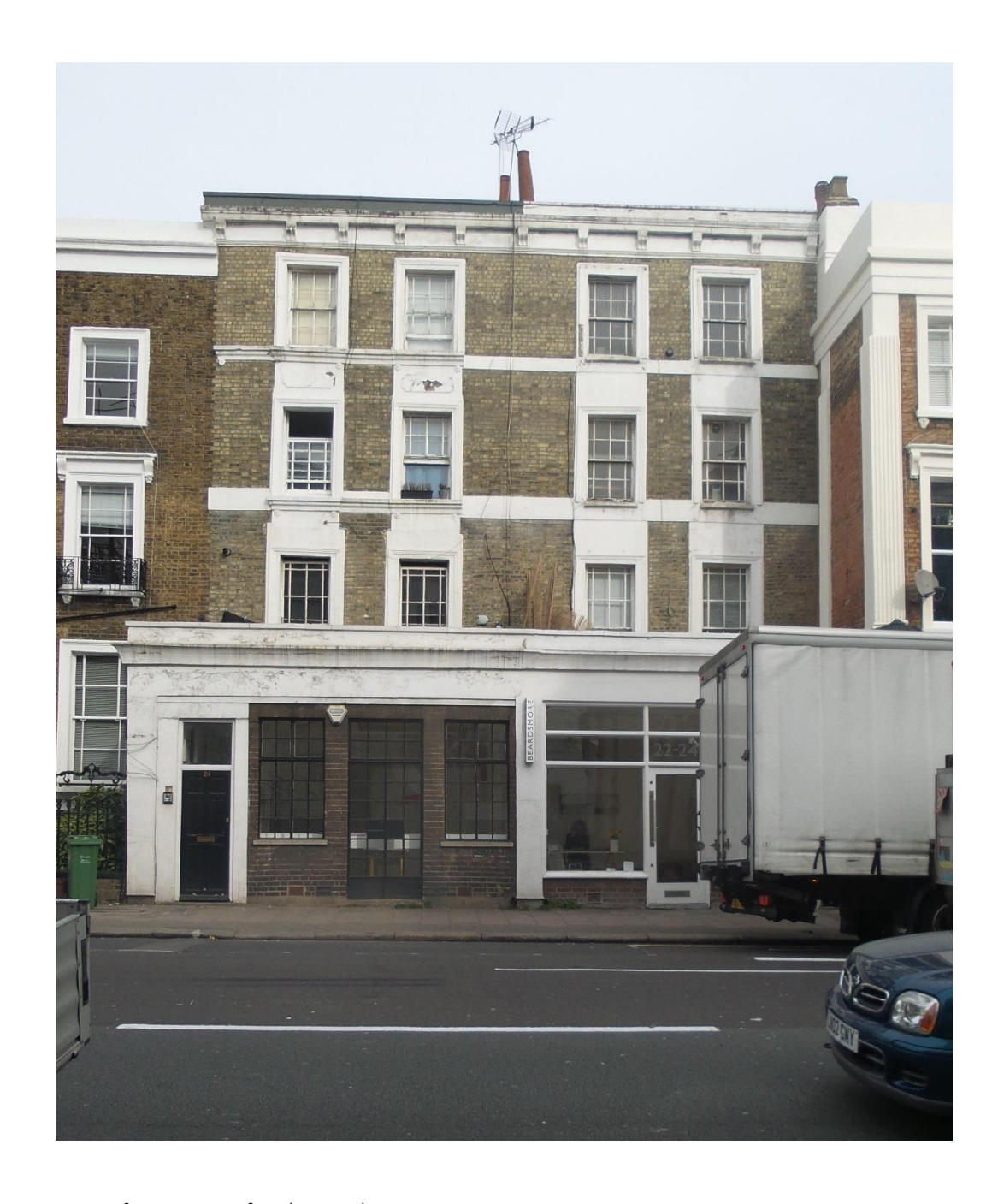
View from Prince of Wales Road