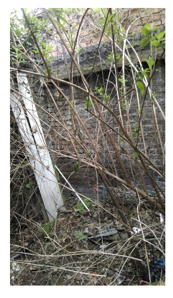
Photographs 22-24 Prince of Wales Road, NW5