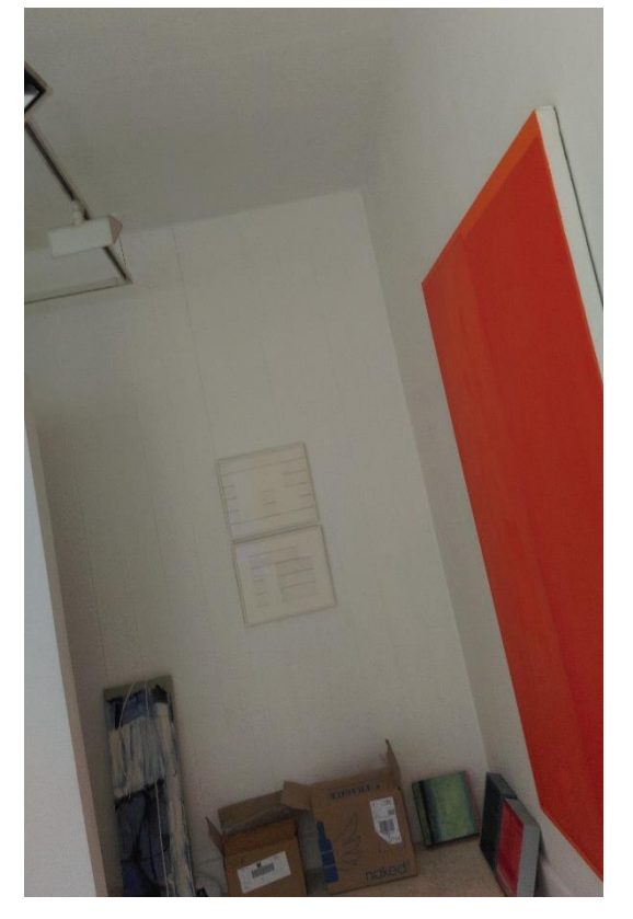
Photographs 22-24 Prince of Wales Road, NW5