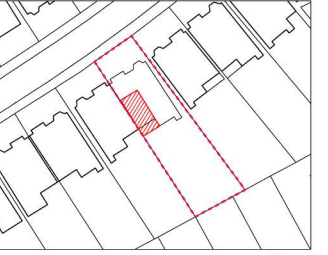
Site Plan - Scale 1:1000 @ A1

NOTES DO NOT SCALE FROM THIS DRAWING. ALL DIMENSIONS TO BE CHECKED ON SITE. ALL OMISSIONS AND DISCREPANCIES TO BE REPORTED TO THE ARCHITECT IMMEDIATELY.