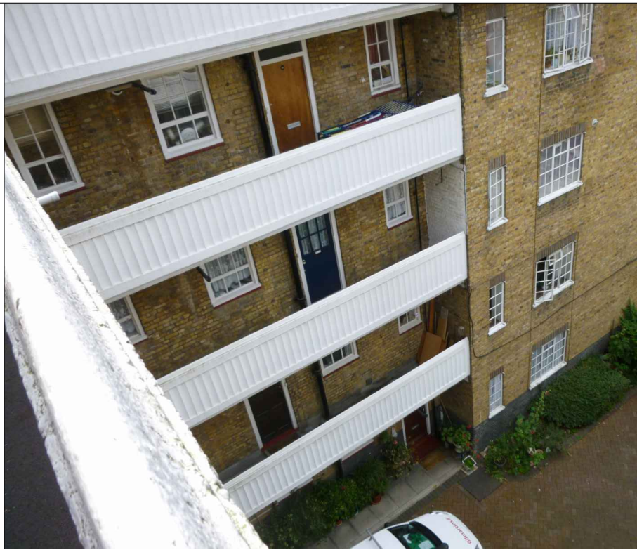
VIEWS OF EXISTING BALCONYS - NEW BALUSTRADE PANELS TO MATCH AS FAR AS POSSIBLE