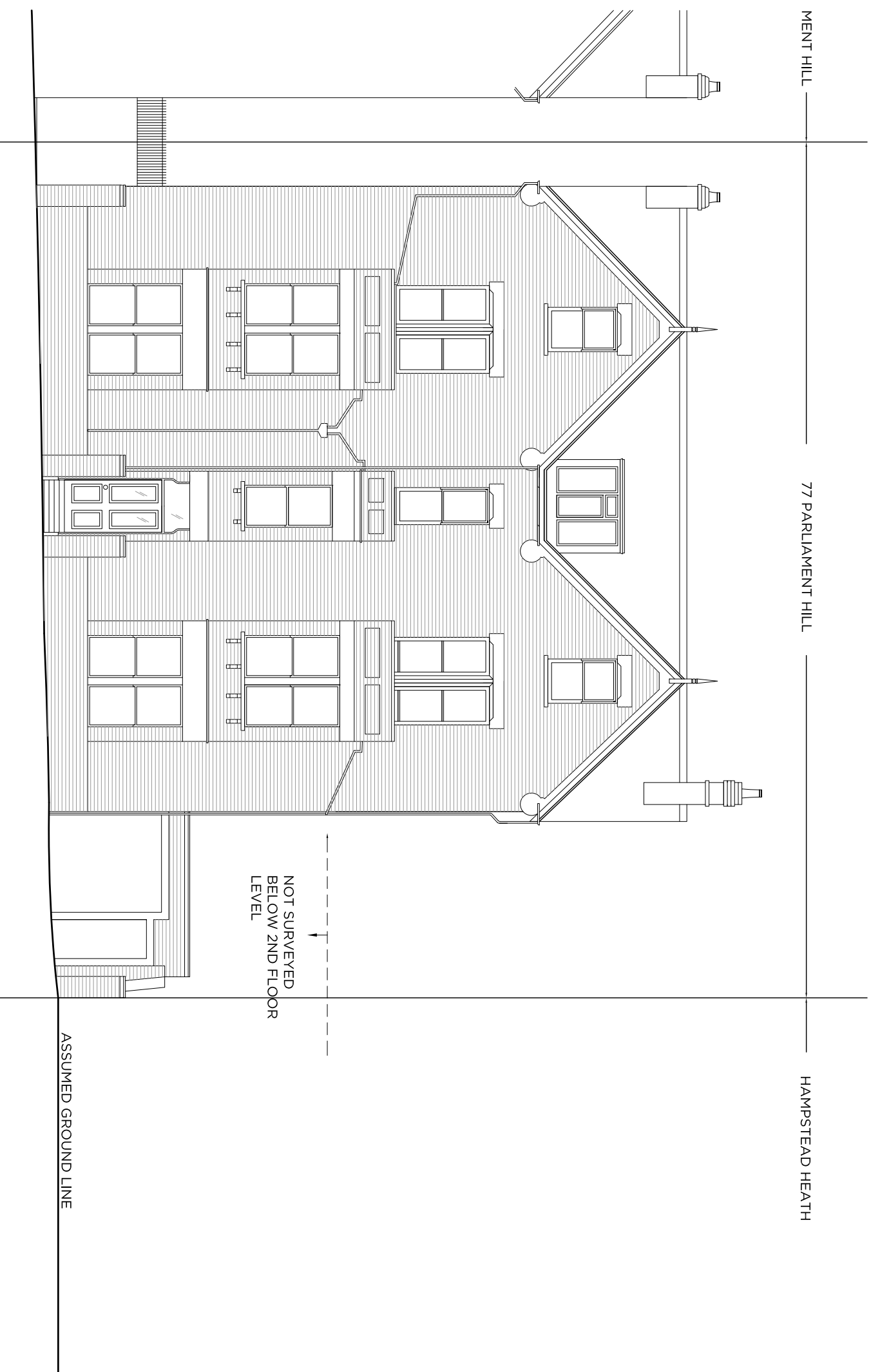
FRONT ELEVATION (EAST) 1:100