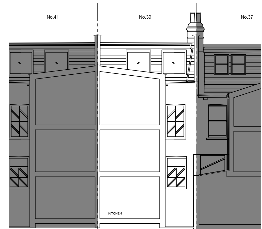
1 EXISTING SOUTHWEST-NORTHEAST SECTION