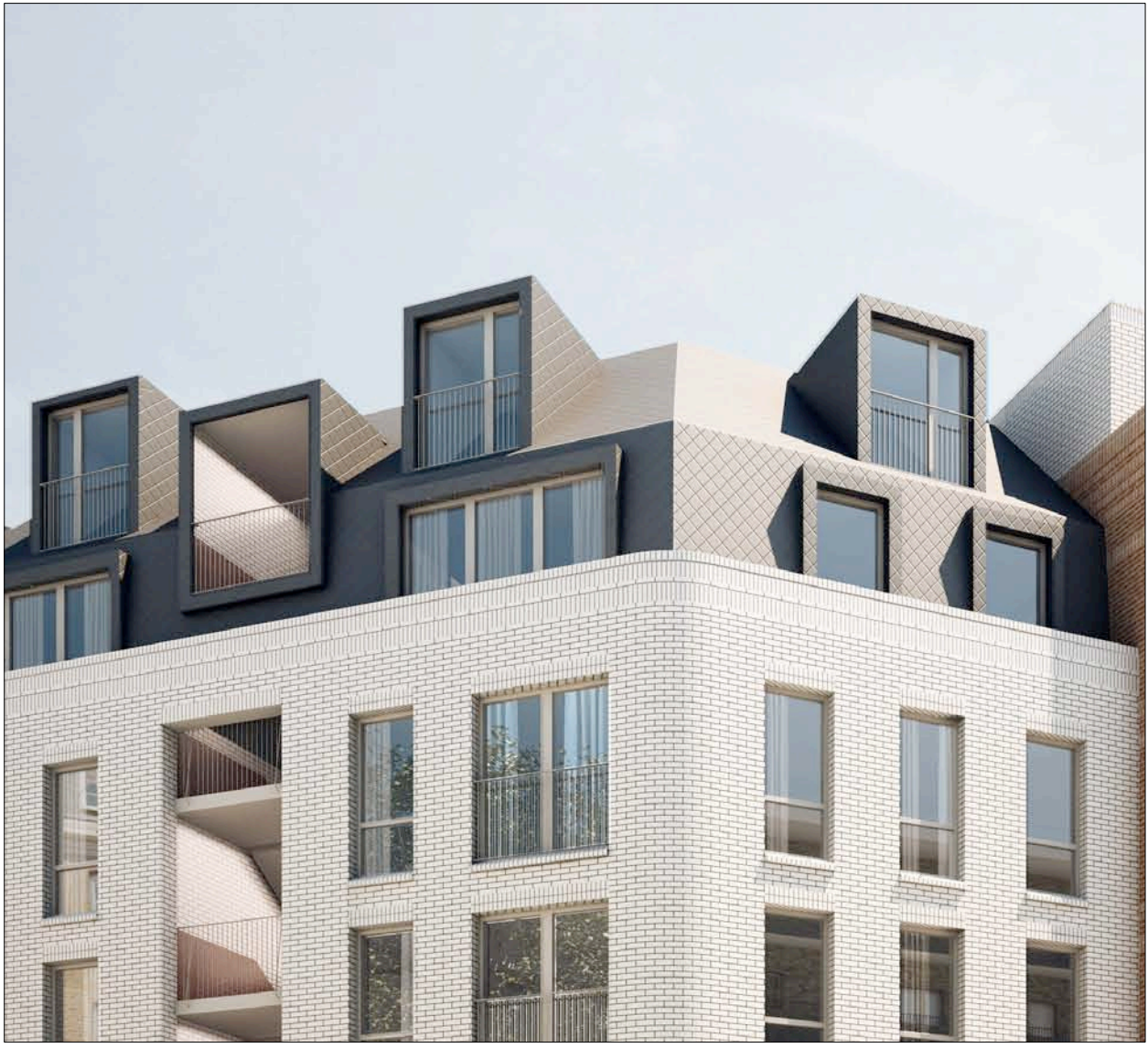
02 Mansard Roof Dormers NTS