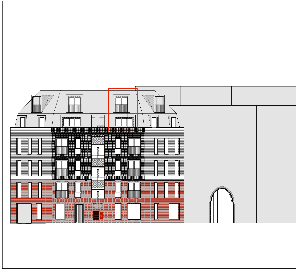
01 Block 1 North West Elevation - Mansard Flats 1:125

Notes: 1. do not scale from this drawing 2. survey indicative only 3. proposals are subject to utilities surveys 4. drawing to be read in conjunction with relevant consultant's information 5. drawing to be read in conjunction with relevant specifications