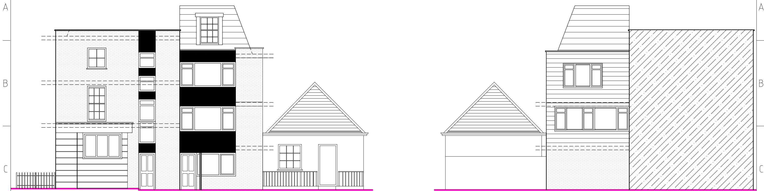
ALDENHAM STREET ELEVATION