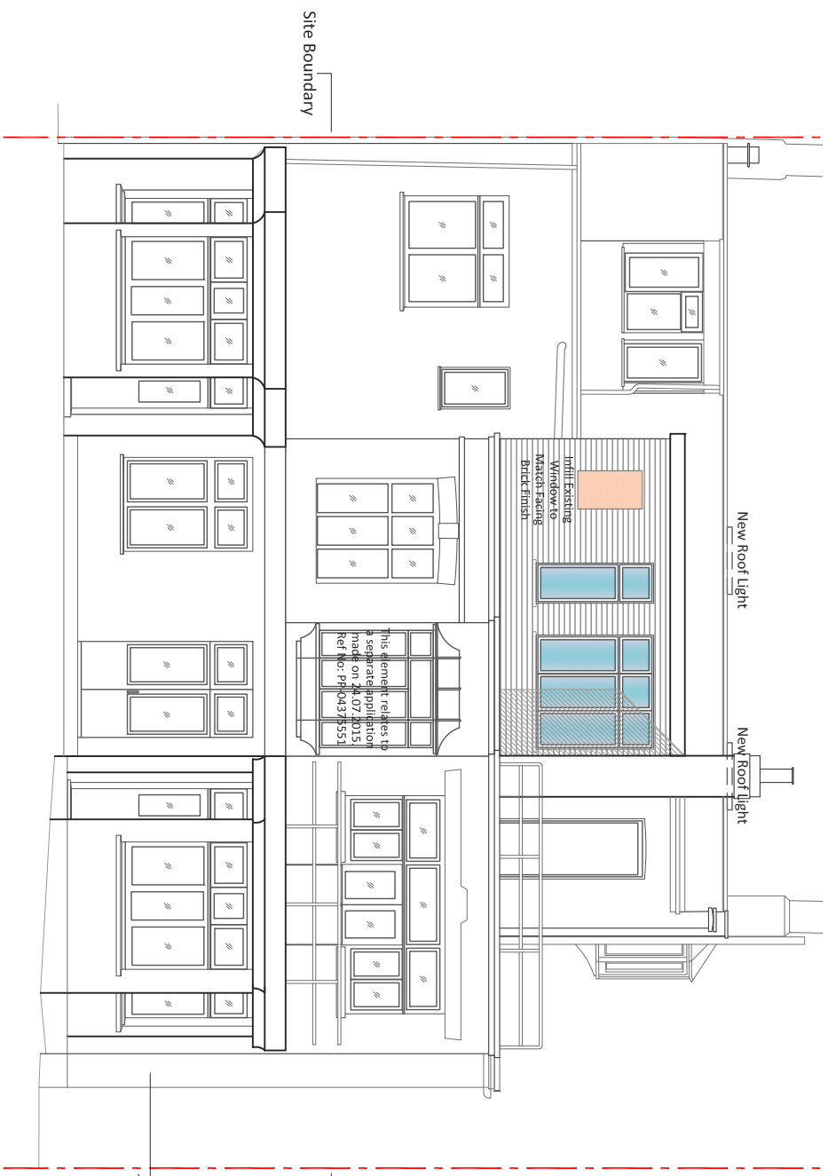
PROPOSED REAR ELEVATION - 1:100@A3