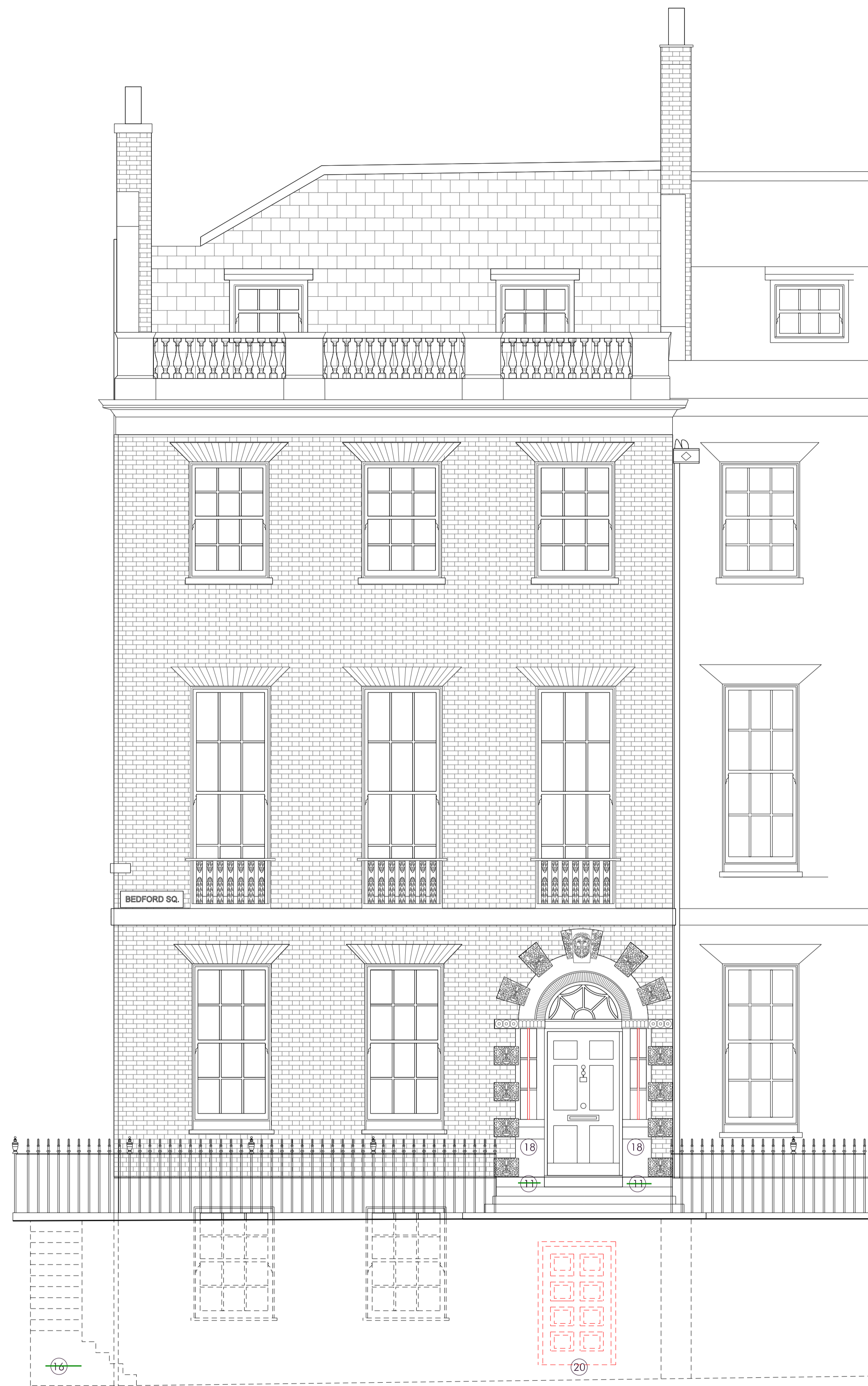
1 NORTH WEST ELEVATION AS EXISTING scale 1:50