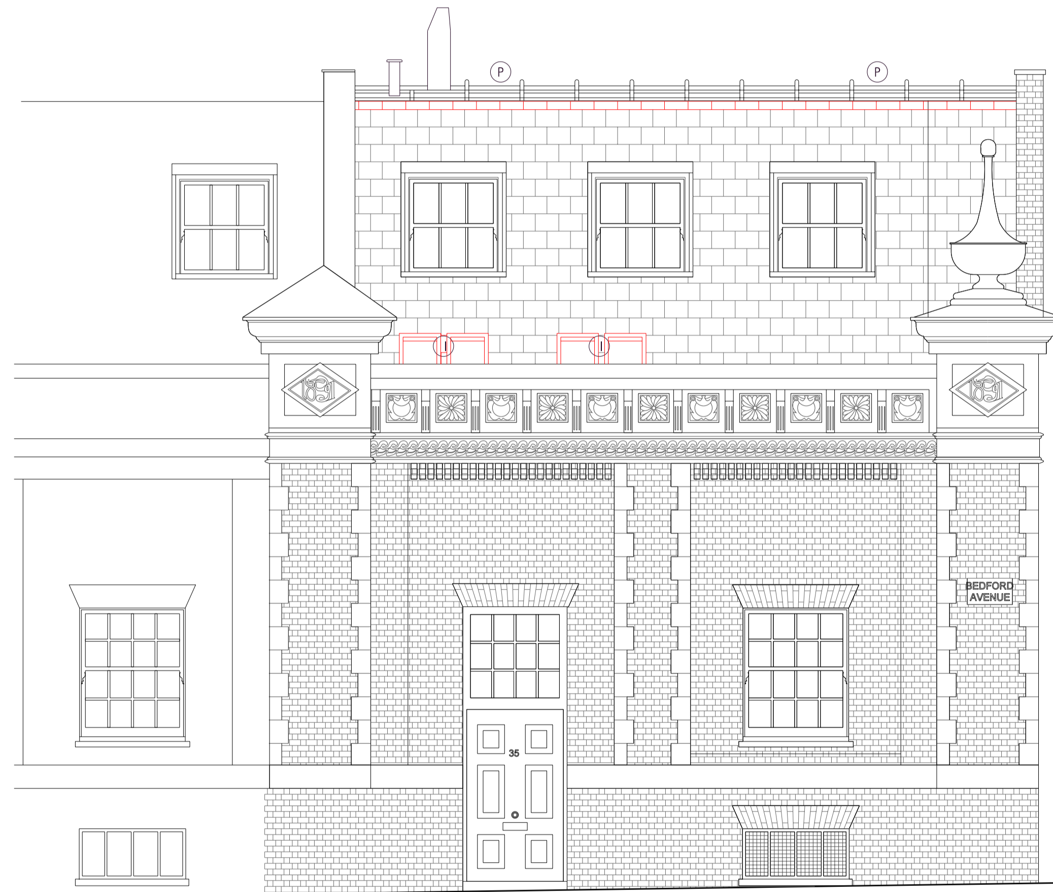
2 SOUTH EAST ELEVATION AS EXISTING scale 1:50