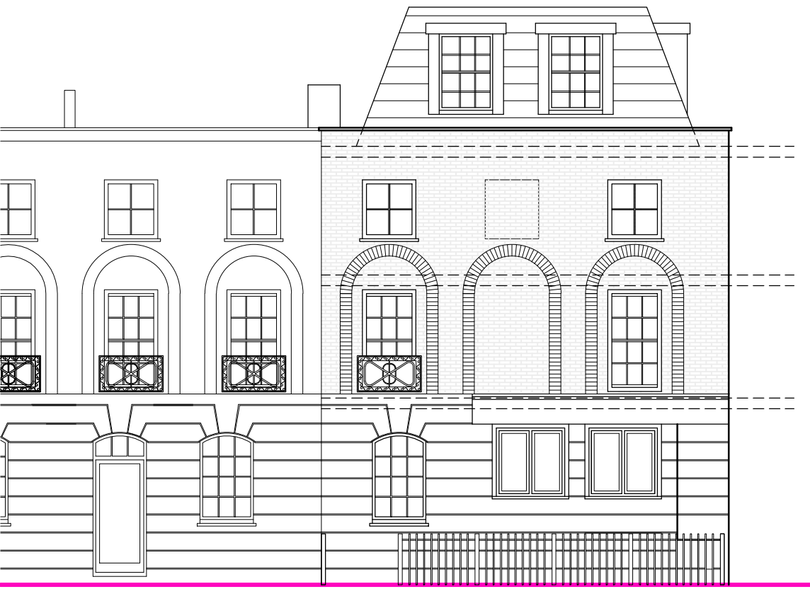
EVERSHOLT STREET ELEVATION