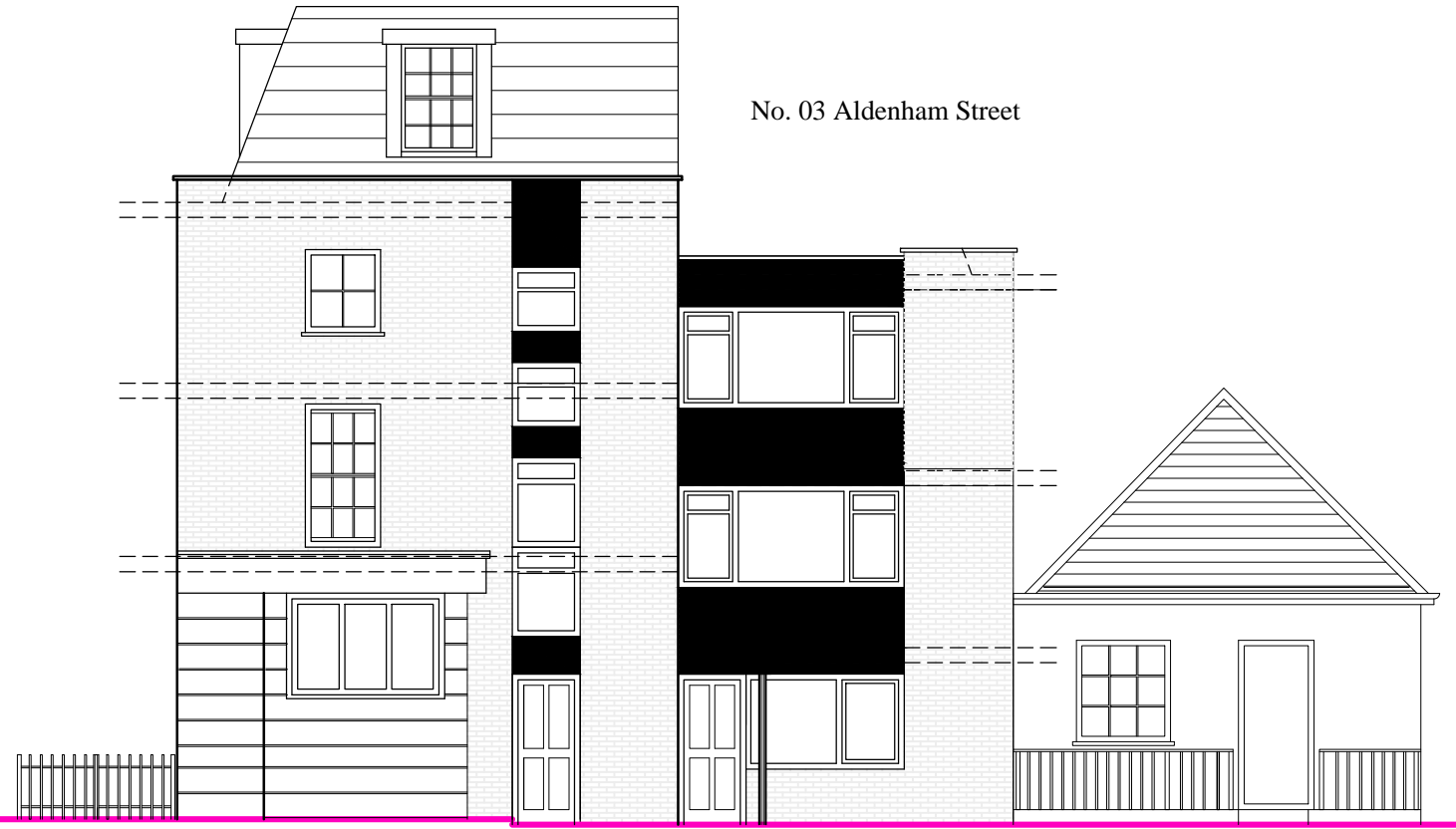
ALDENHAM STREET ELEVATION