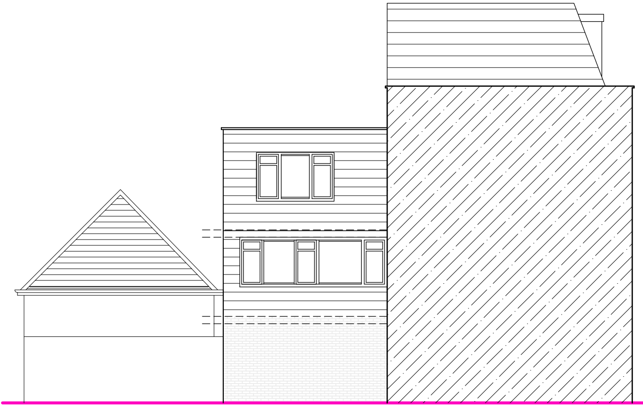
NORTH-WEST ELEVATION (REAR)